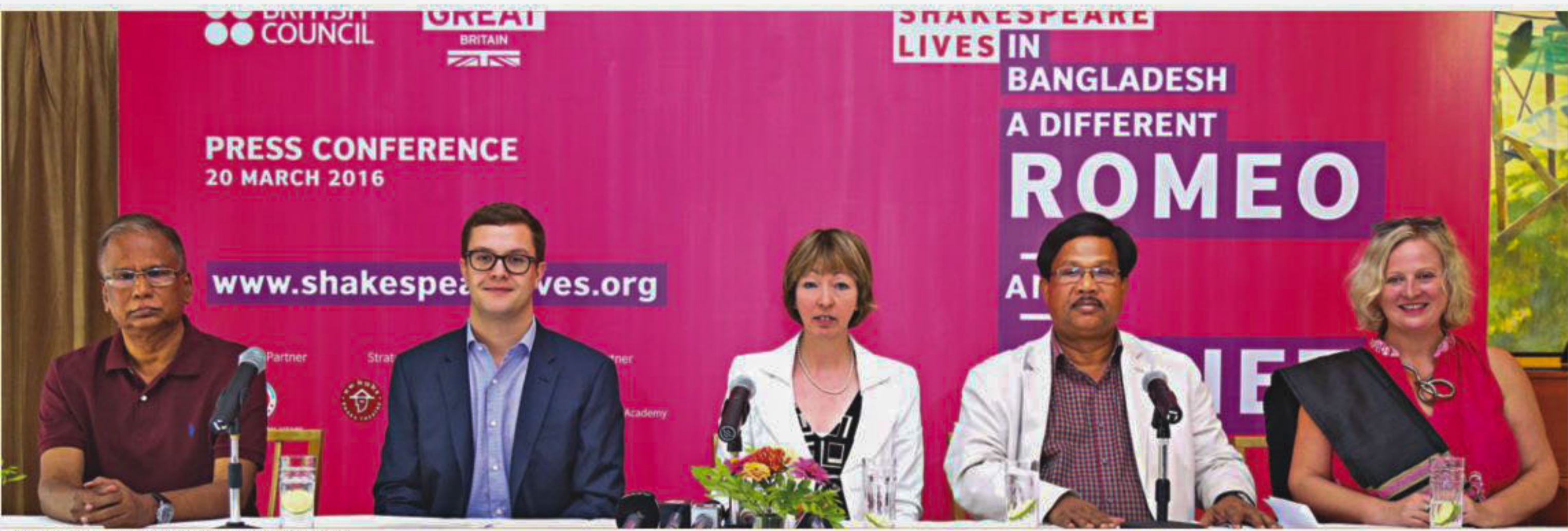
Guests at the press conference.