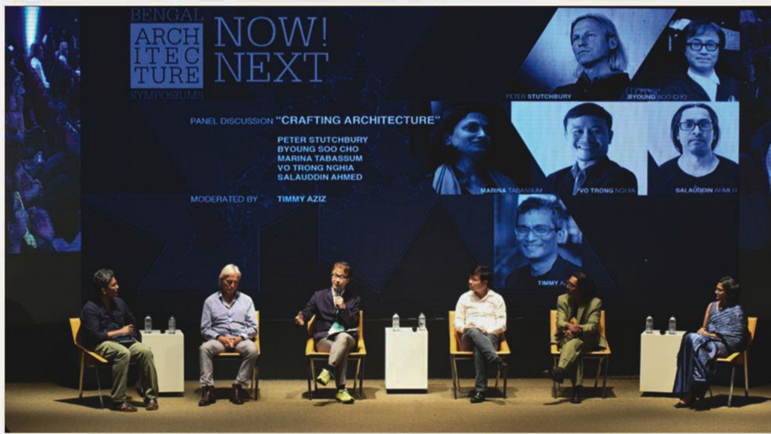
Speakers at the panel discussion.