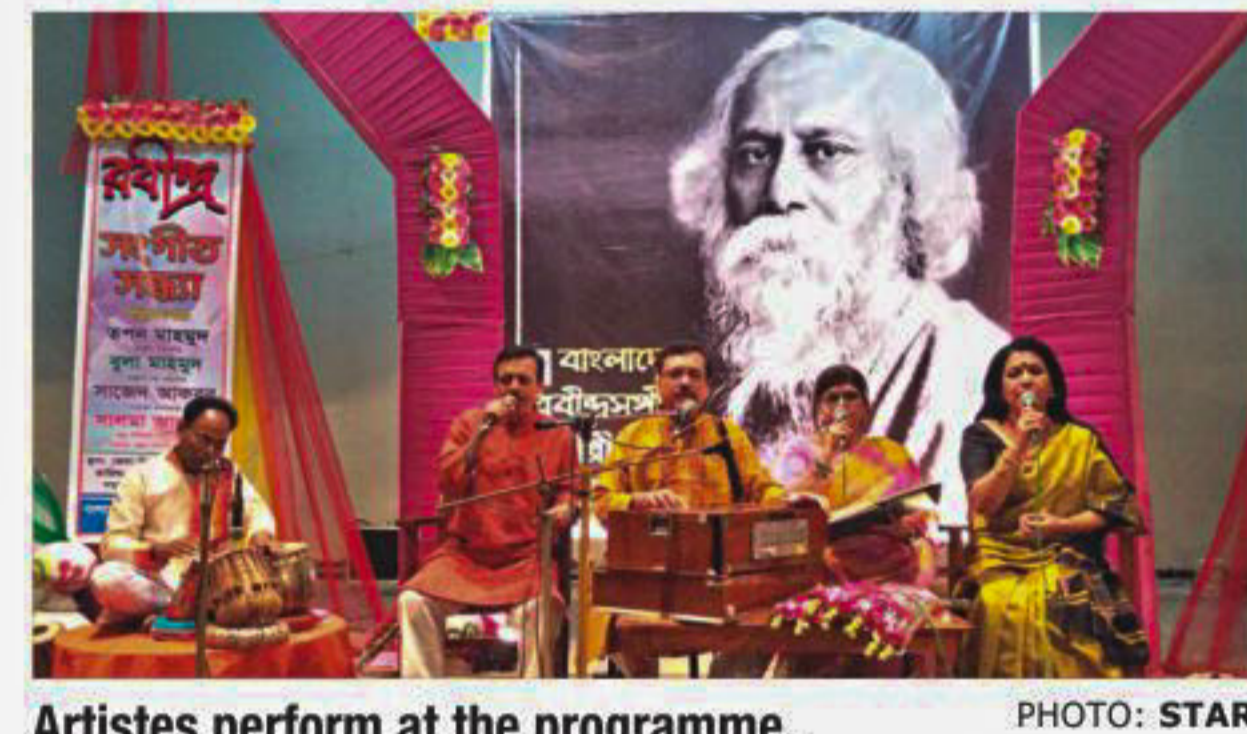
Artistes perform at the programme.