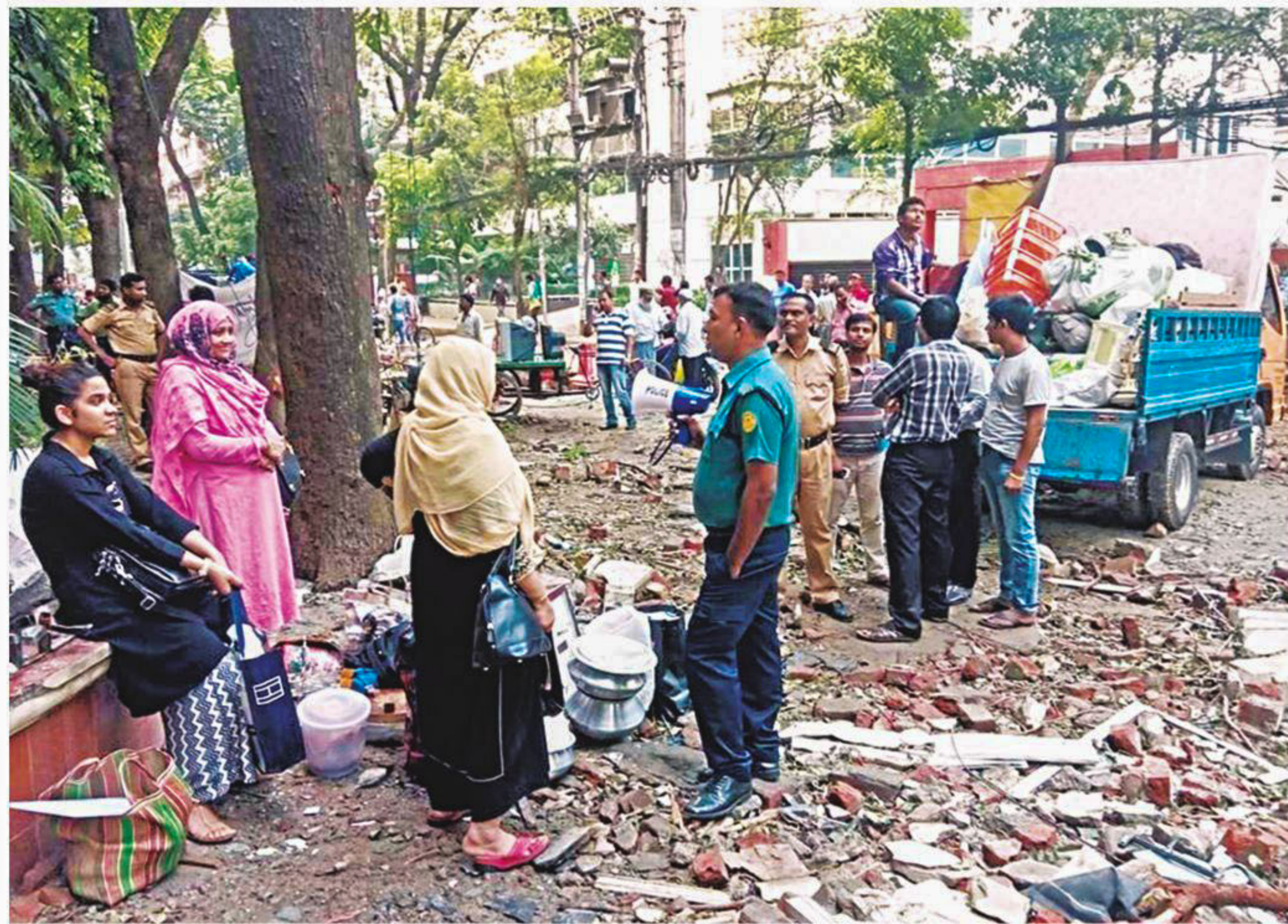
Residents move their belongings yesterday from the Banani building that was damaged in an explosion caused by suspected gas leak early Friday.