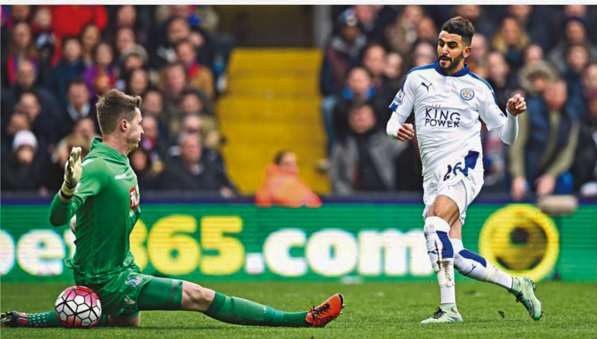
Leicester City winger Riyad Mahrez (R) scored the only goal of the Foxes' Premier League clash against Crystal Palace at Selhurst Park yesterday with a fine shot from a Jamie Vardy cross. The 1-0 win stretched the Foxes' lead at the top of the table to eight points.