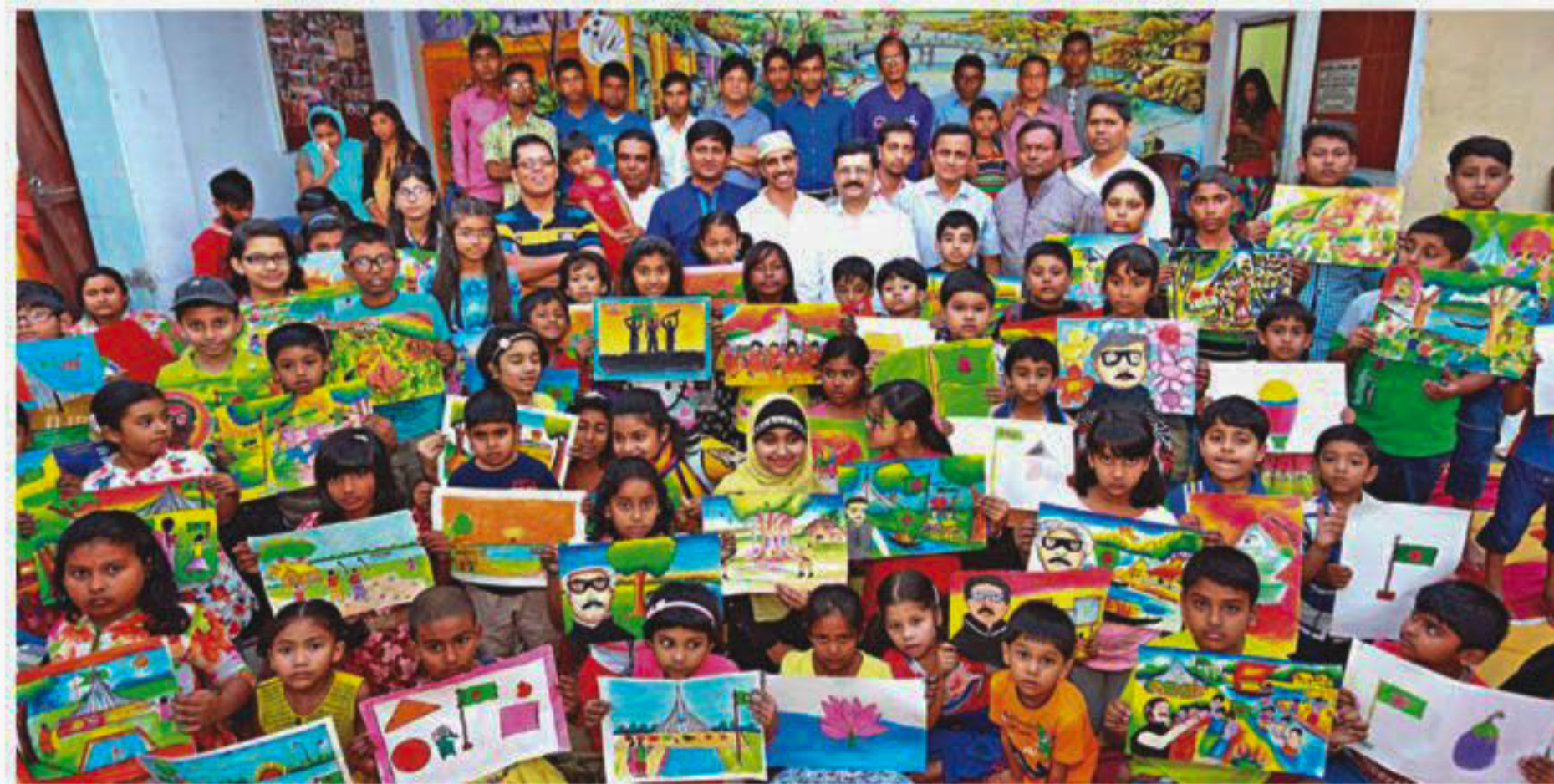
Participants hold up their paintings.