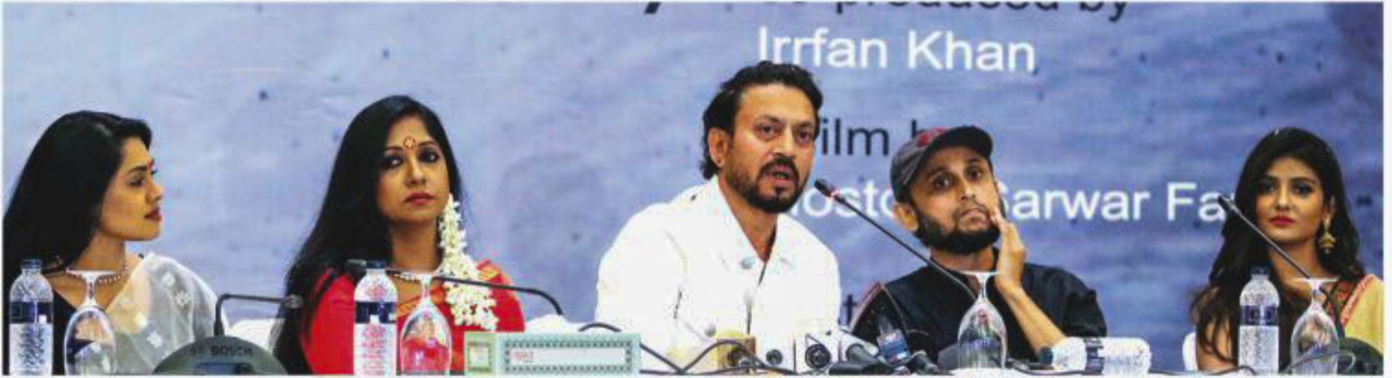
(Top) The 'muhurat' moment; Irrfan answers journalists' questions.

More frantic selfies and photo-sessions followed in the brief period after Irrfan stuck around after the event, and only after he left did the attention shift to the dinner that awaited the guests.