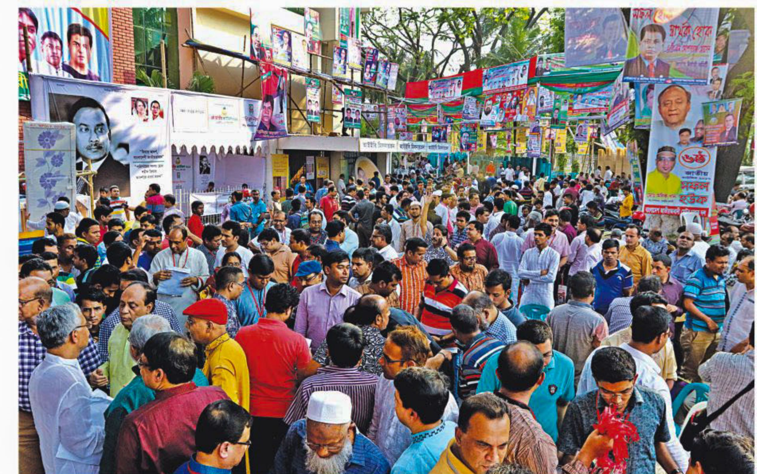
BNP leaders and activists through the Institution of Engineers, Bangladesh in the city yesterday ahead of the party's sixth national council today.