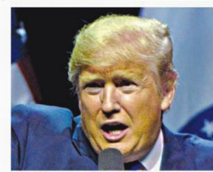
from Carnegie Mellon University's Language Technologies Institute (LTI) wanted to establish the reading level of the candidates' speeches. They analysed a number of transcripts for each candidate, including campaign trail speeches, victory speeches and defeat speeches.

INDEPENDENT.CO.UK The grammar used by Donald Trump in his speeches as he campaigns to become the Republican presidential candidate corresponds to that used by students aged 11 and under. The 69-year-old businessman's language tailed his counterparts. Ted Cruz and Marco Rubio -- both used grammar corresponding to children aged between 11 and 14 -- students between grades six and eight in the US. But their vocabulary was more advanced and matched students aged between 13 and 16. In the study, "A Readability Analysis of Campaign Speeches from the 2016 US Presidential Campaign", researchers