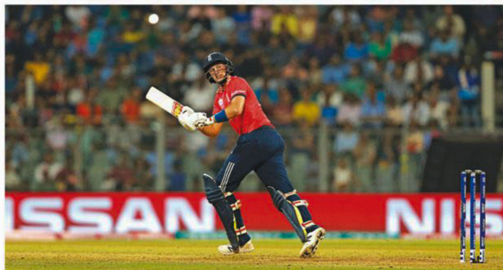
England batsman Joe Root played shots all around the ground during a 44-ball 83 as England chased down South Africa's 229 in a thrilling World Twenty20 encounter at the Wankhede Stadium in Mumbai yesterday.