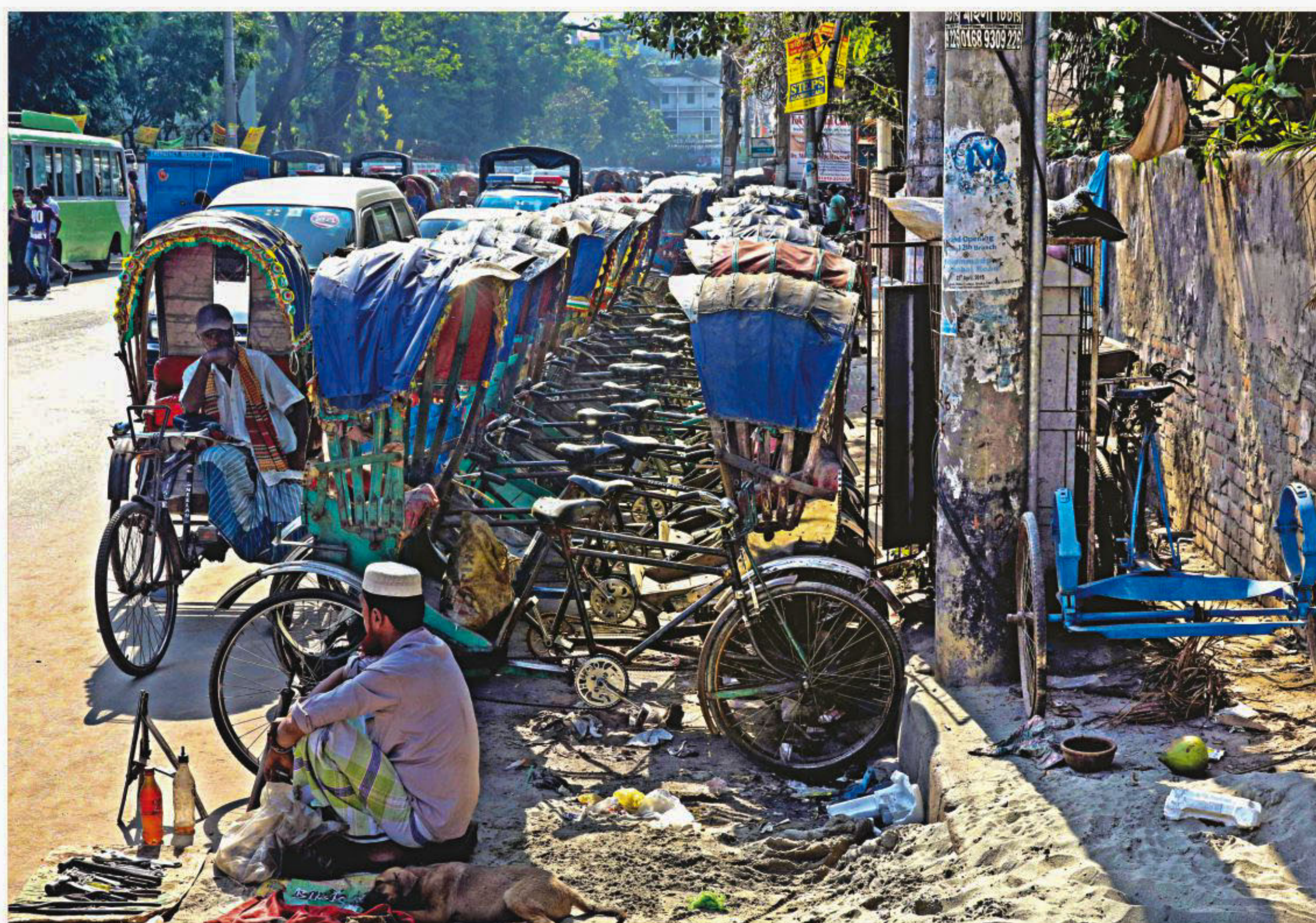
A rickshaw garage occupying the footpath on Gaznabi Road in the capital's Mohammadpur begs the question: for what and for whom this footpath is anyway? The photo was taken yesterday.