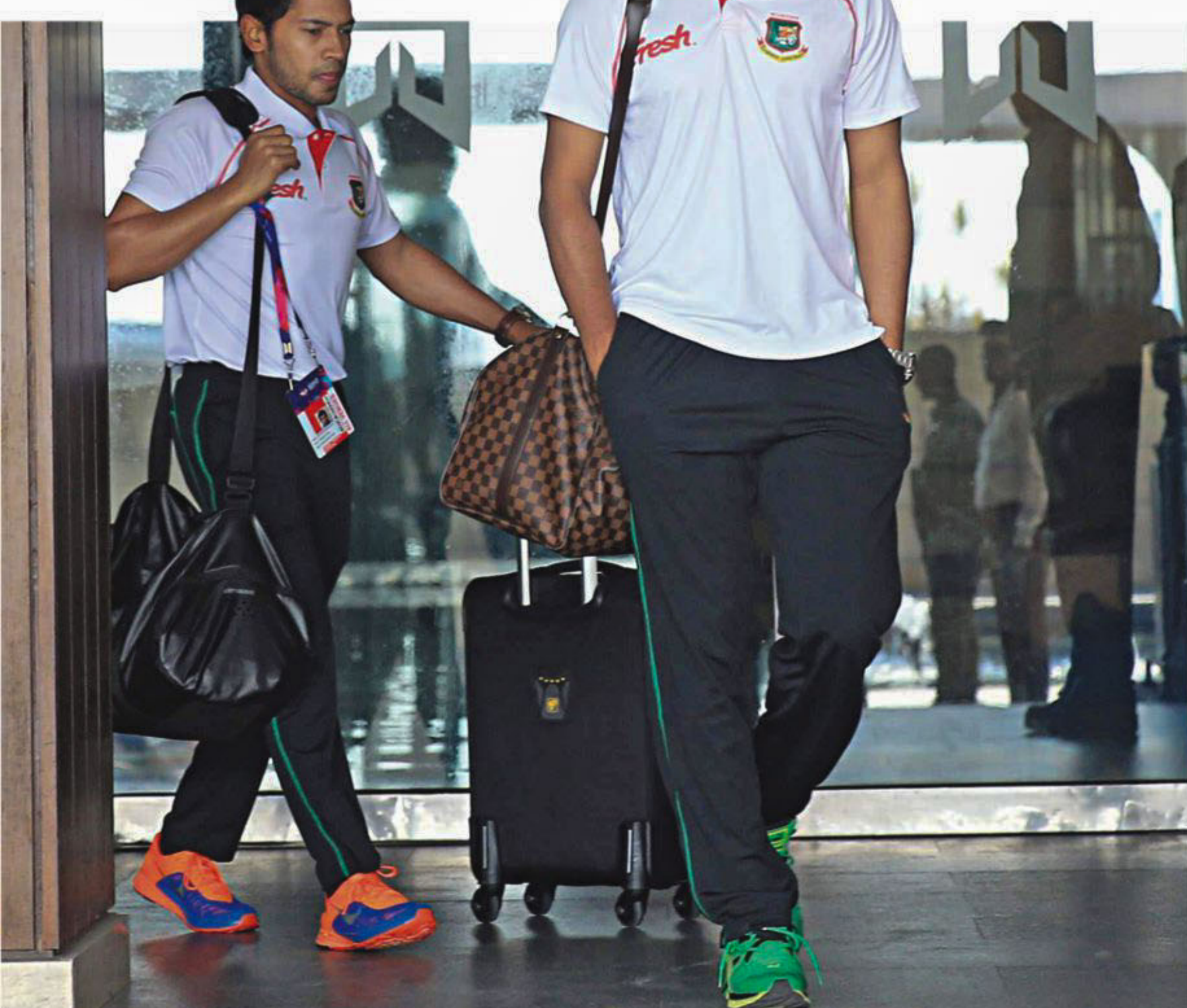
The Bangladesh team departed from Kolkata yesterday with their next stop at Bangalore, where they will face the mighty Australia. However, amidst all the festivities of the ICC World Twenty20, the Tigers painted a sombre portrait -- all of them looked dejected as they came and went after their crushing defeat to Pakistan.