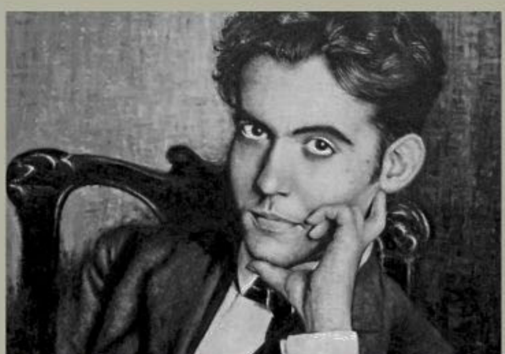
FEDERICO GARCIA LORCA

I want to be a poet, from head to toe, living and dying by poetry.