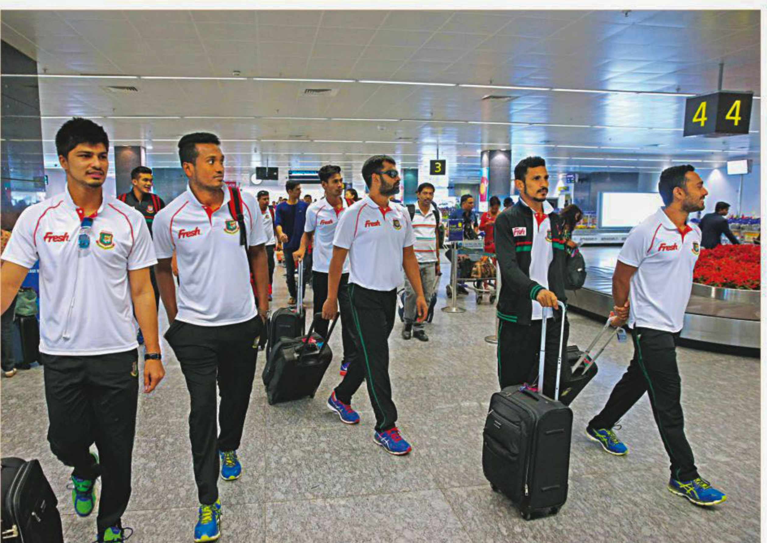
After a harrowing experience in Kolkata, the Bangladesh cricket team will hope for better times in Bangalore, where they arrived yesterday to play against Australia in their second ICC World Twenty20 match on Monday.