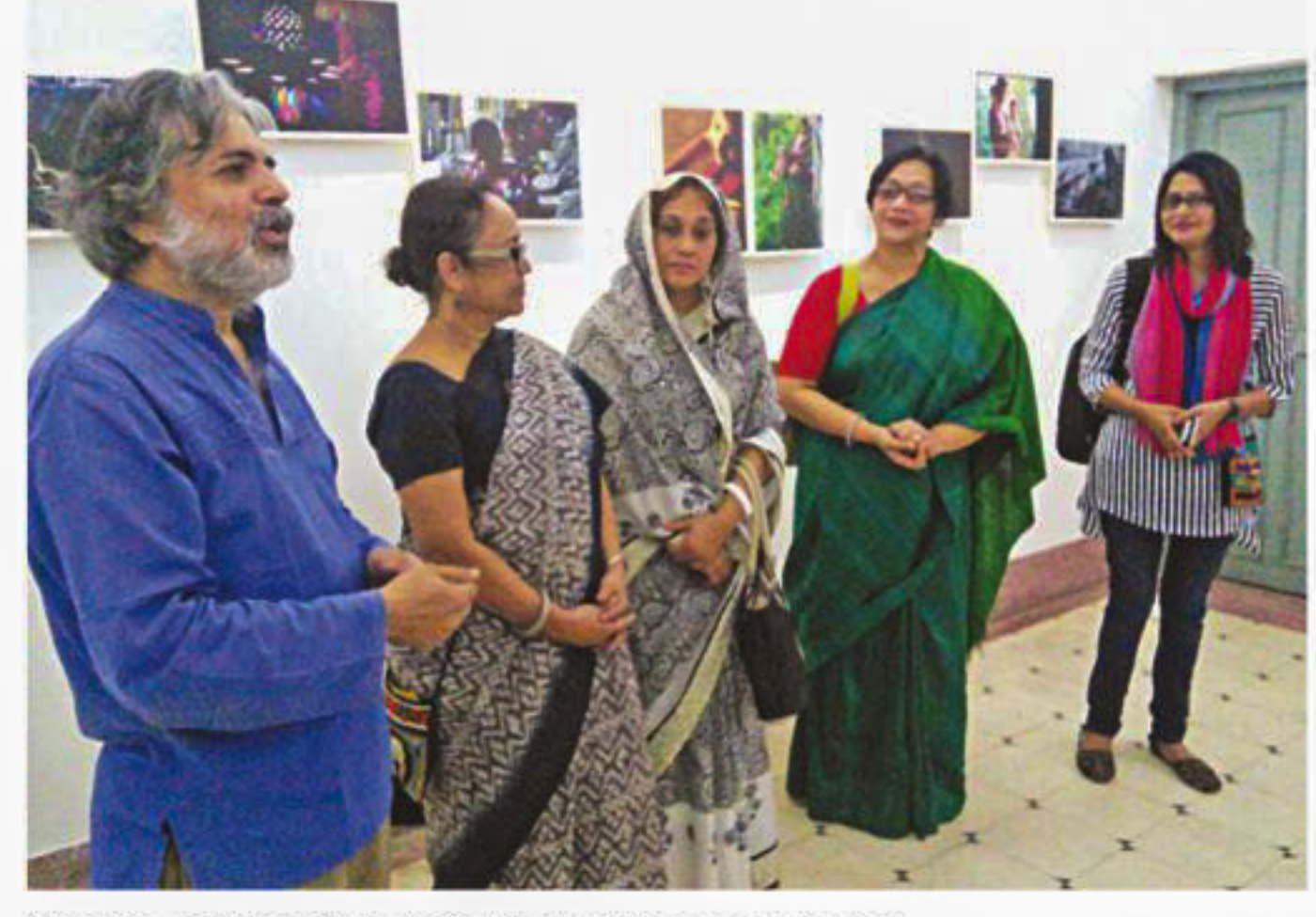
Guests at the inauguration of the exhibition.