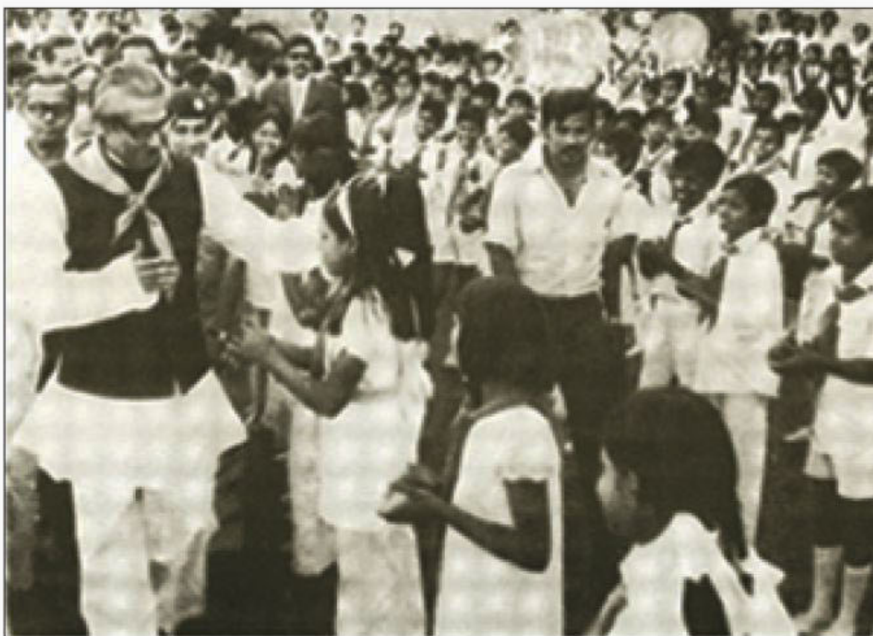
Dhaka City Awami League : Prayers were offered for the long life of Bangabandhu at a Milad programme organized by the Dhaka city Awami League at its office yesterday.