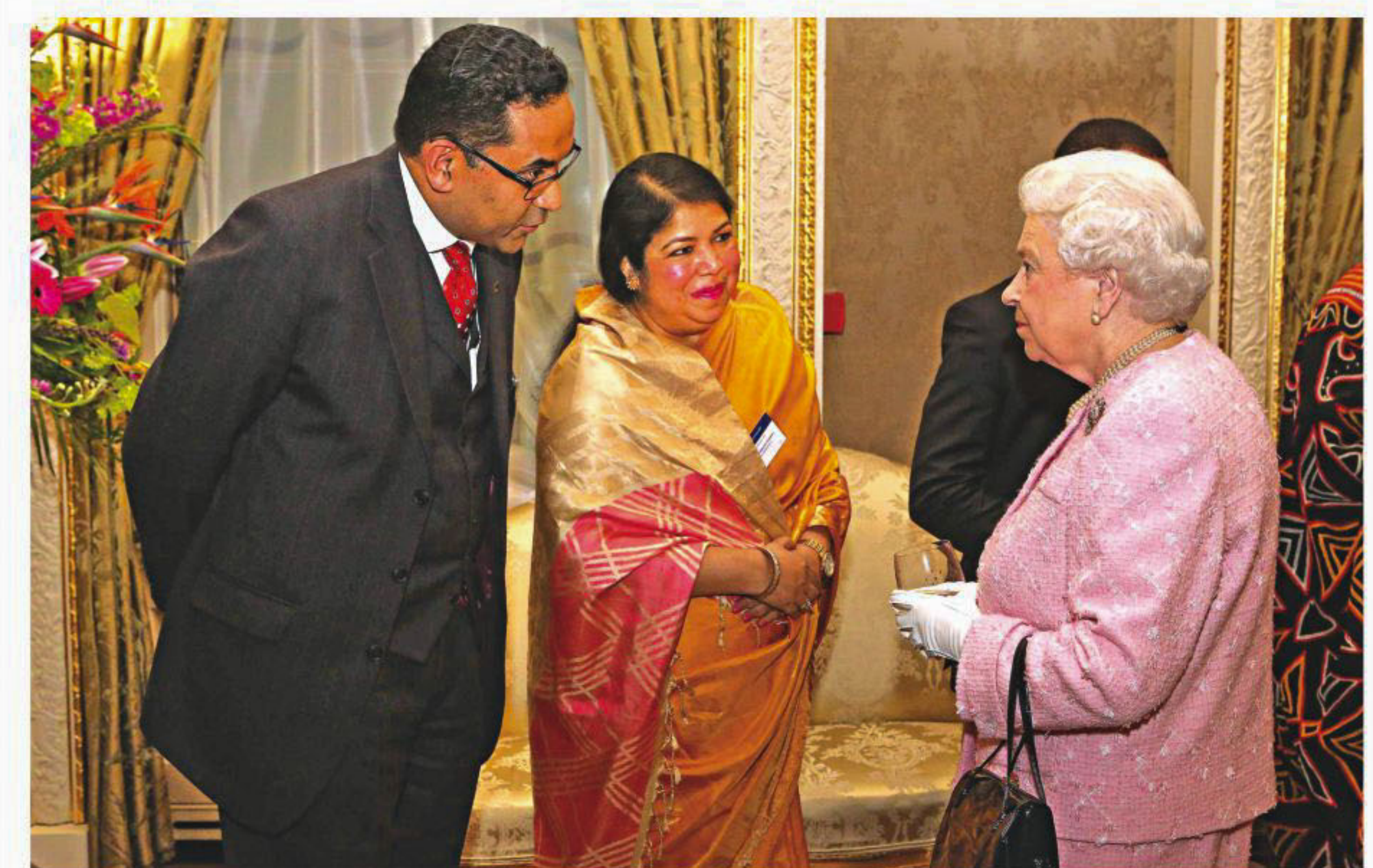
Jatiya Sangsad Speaker Shirin Sharmin Chaudhury, also chairperson of the Commonwealth Parliamentary Association (CPA), meets Britain's Queen Elizabeth II at the Marlborough House in London on Tuesday. The Speaker apprised the Queen, also head of the Commonwealth, of the CPA activities and future plans.

The government decided to cancel their contracts for their "failure" to pre-