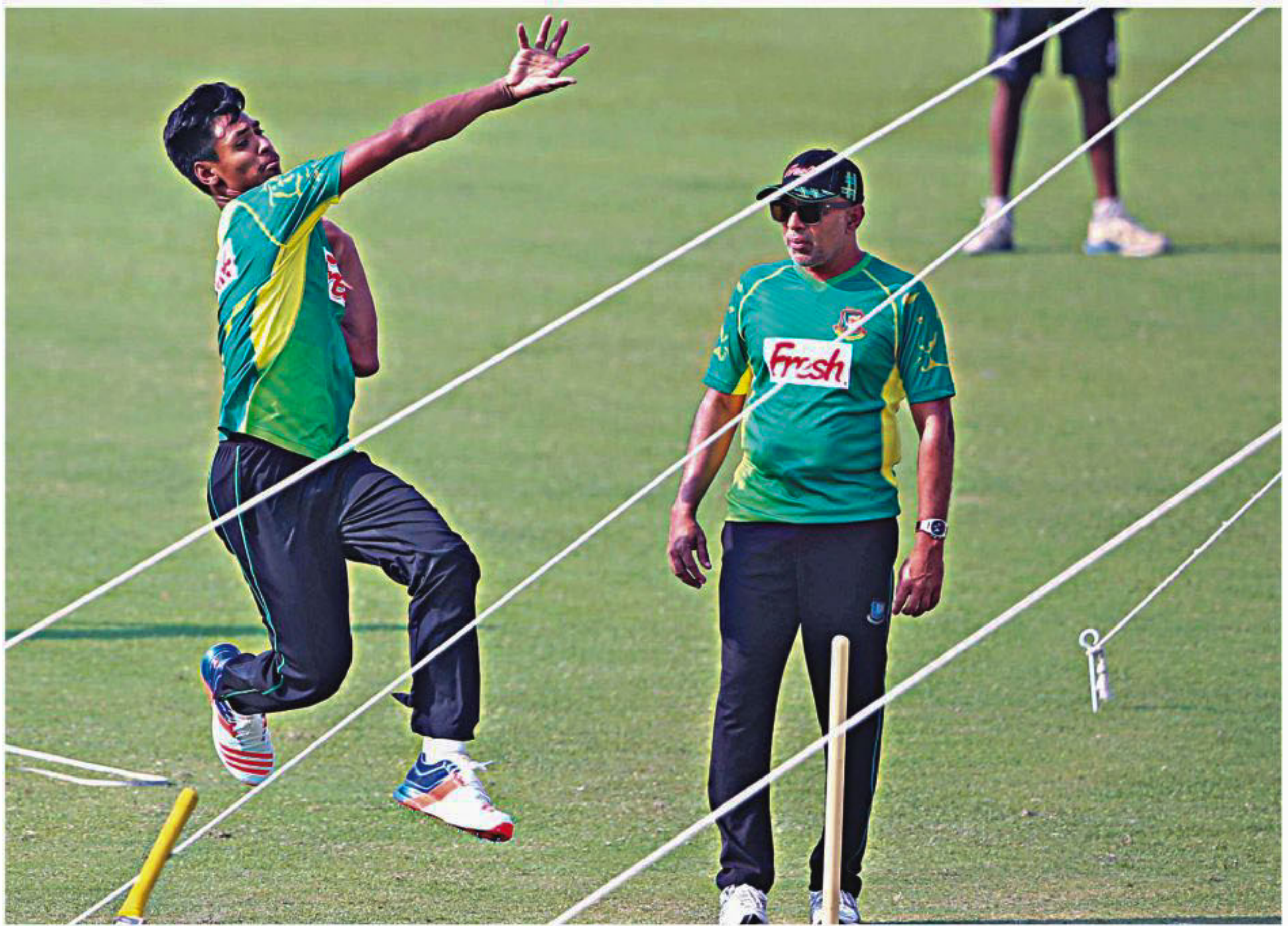
MUSTAFIZUR'S RETURN: Bangladesh pacer Mustafizur Rahman is observed by coach Chandika Hathurusingha during practice in the Eden Gardens yesterday. He is expected to return from a side strain and feature against Pakistan today.

With Mustafizur around it not only adds variety to the Tigers' bowling, but more importantly it will act as insurance for Mashrafe, both in desperate and good times. And unless something extraordinary happens, the young pace bowling sensation is all set to walk onto the world stage at one of the world's premier venues.