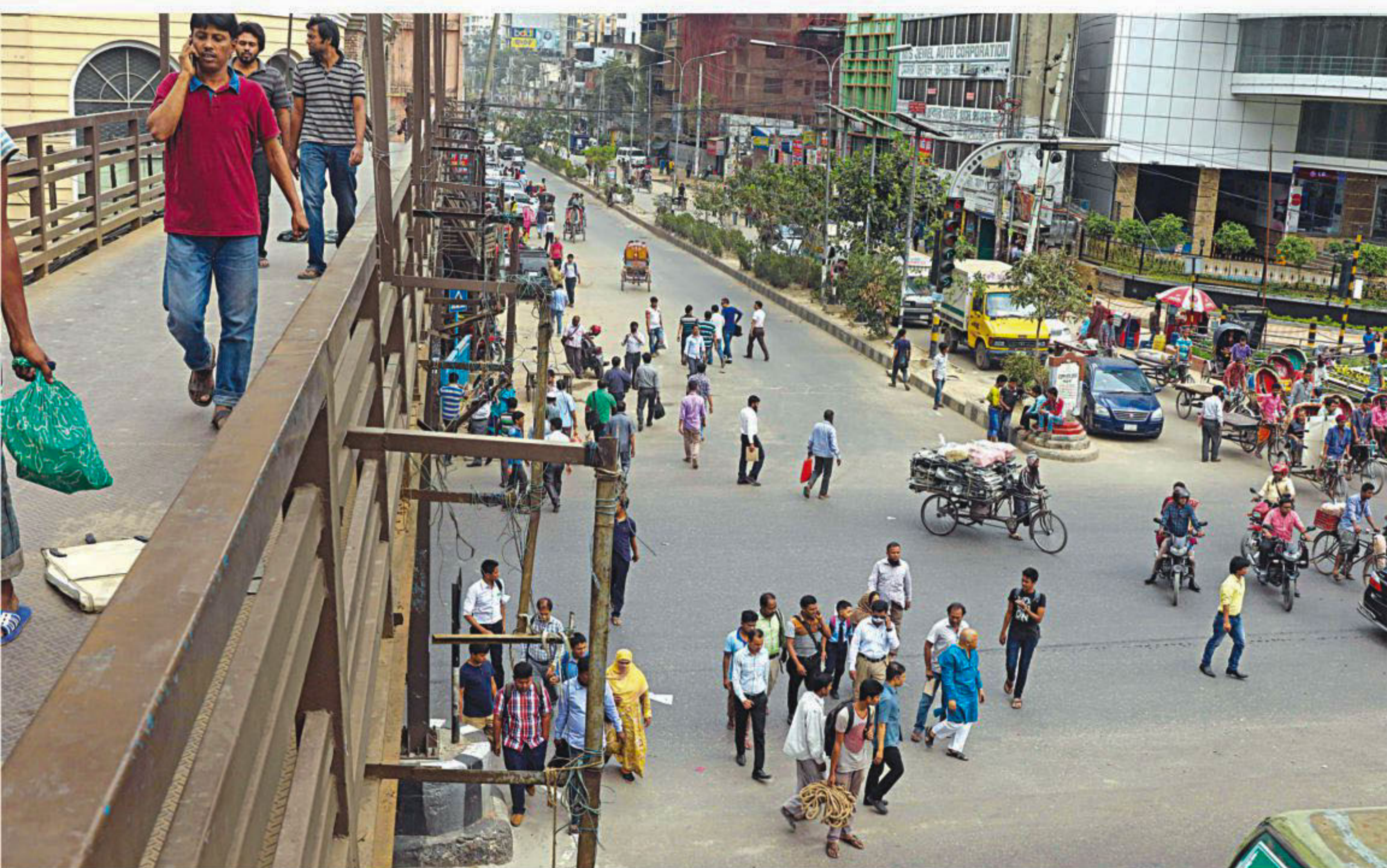
Pedestrians crossing the busy Bangla Motor intersection in the city although there is a footbridge nearby. Only a few people use the footbridge while most others do not bother doing so. This utter disregard for traffic rule often leads to fatal accidents. The photo was taken yesterday.