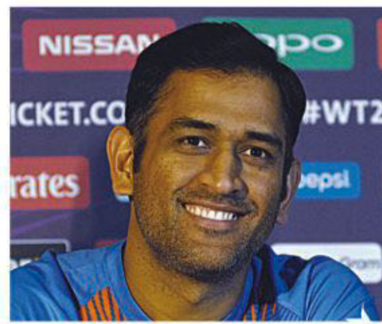
MAHENDRA SINGH DHONI

They thrashed the holders Sri Lanka last Thursday when Colin Munro, Corey Anderson and Grant Elliott all posted half-centuries in