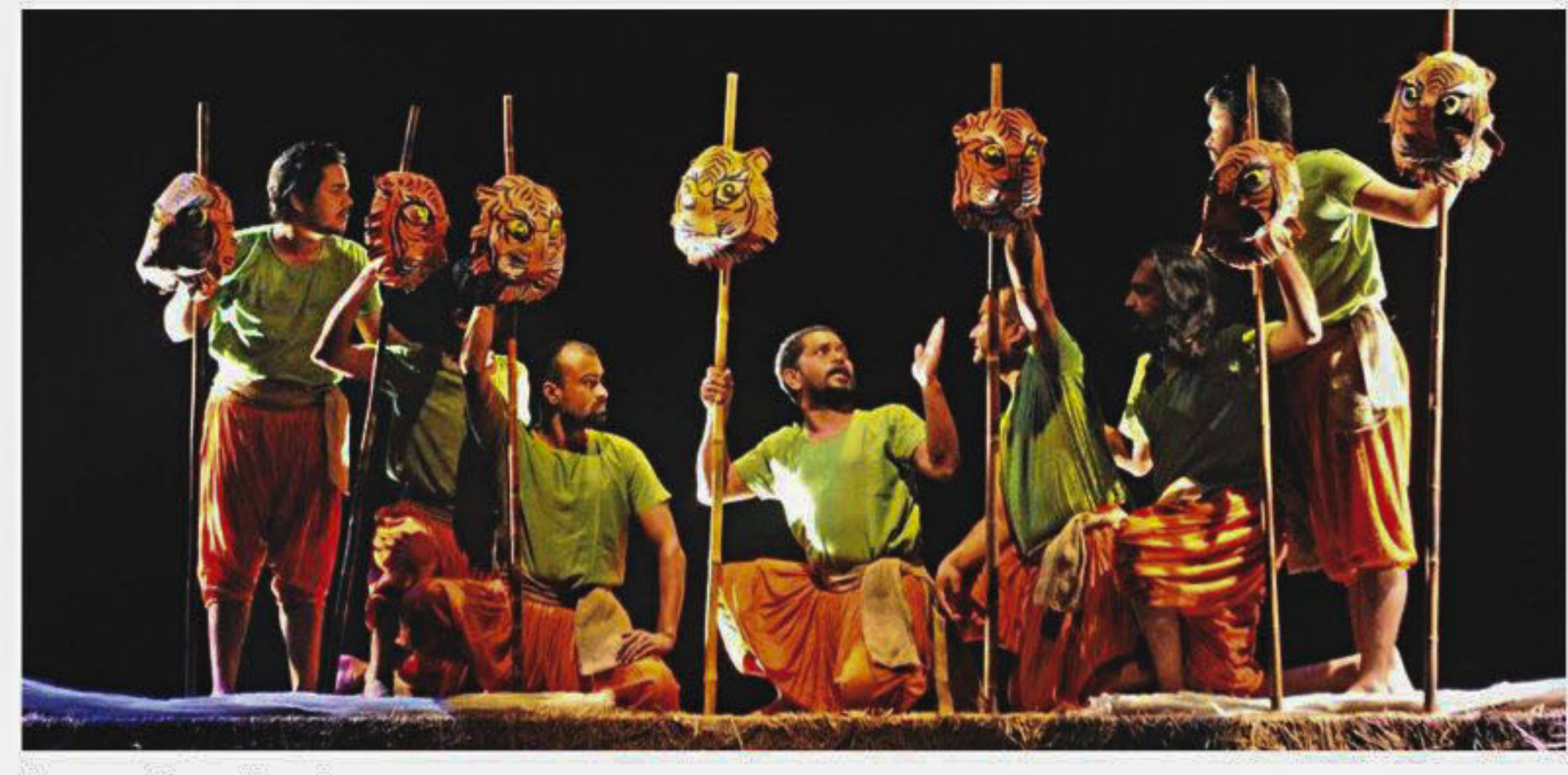
A scene from the play.