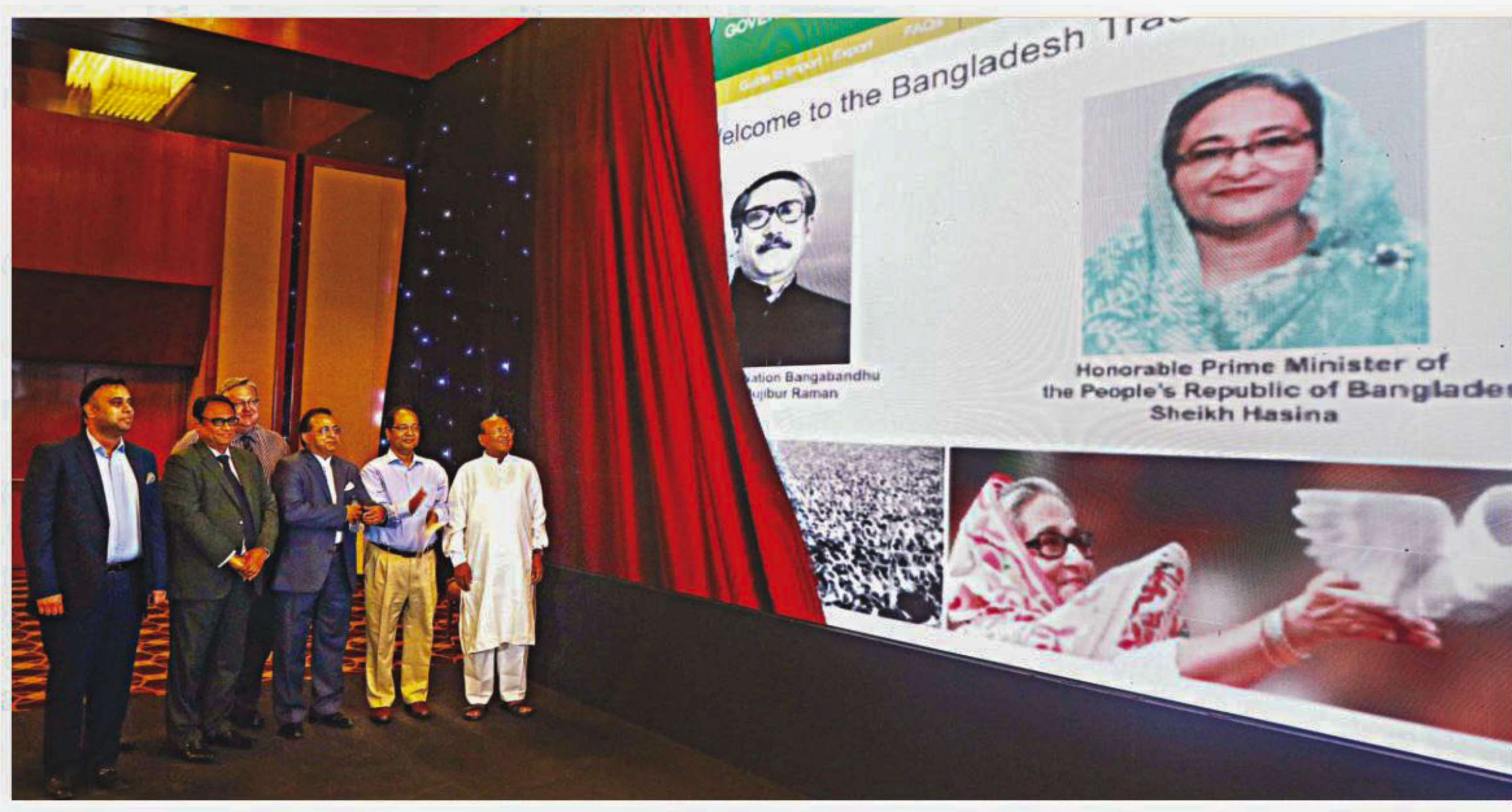
Extreme right, Commerce Minister Tofail Ahmed poses at the launch of Bangladesh Trade Portal, at Sonargaon hotel in Dhaka yesterday.