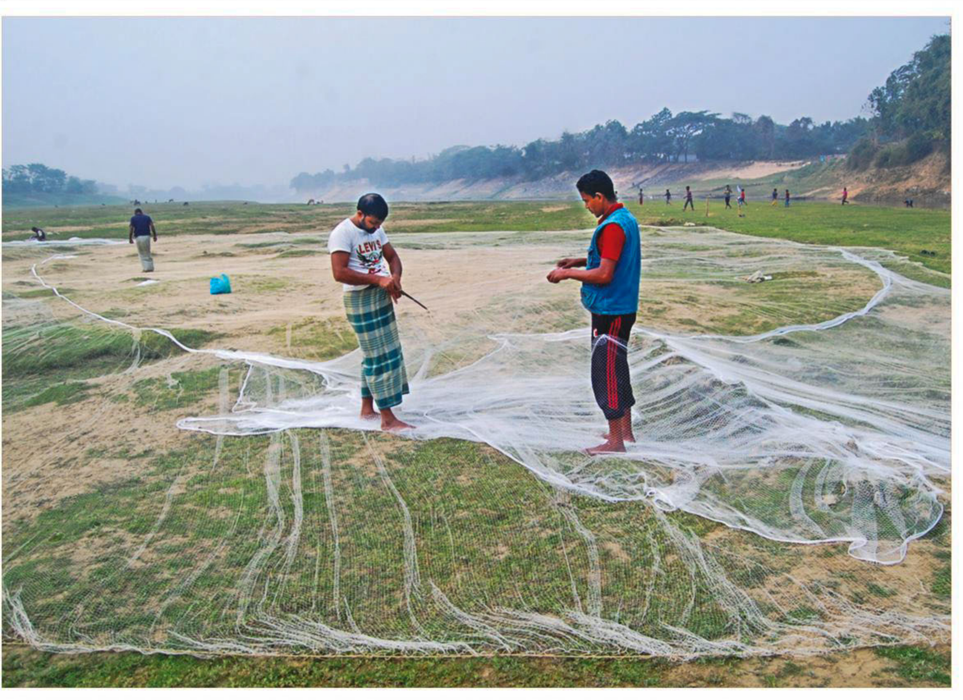
Fishermen doing repairs of their current nets at a char of the Surma river in Sylhet's Kushighat yesterday. Despite the ban on such nets as it harms the eco system by netting young fishes, its use go unabated due to poor monitoring and enforcement of law. What's worse, current nets cost a third of regular nets making it rather appealing for fishermen.