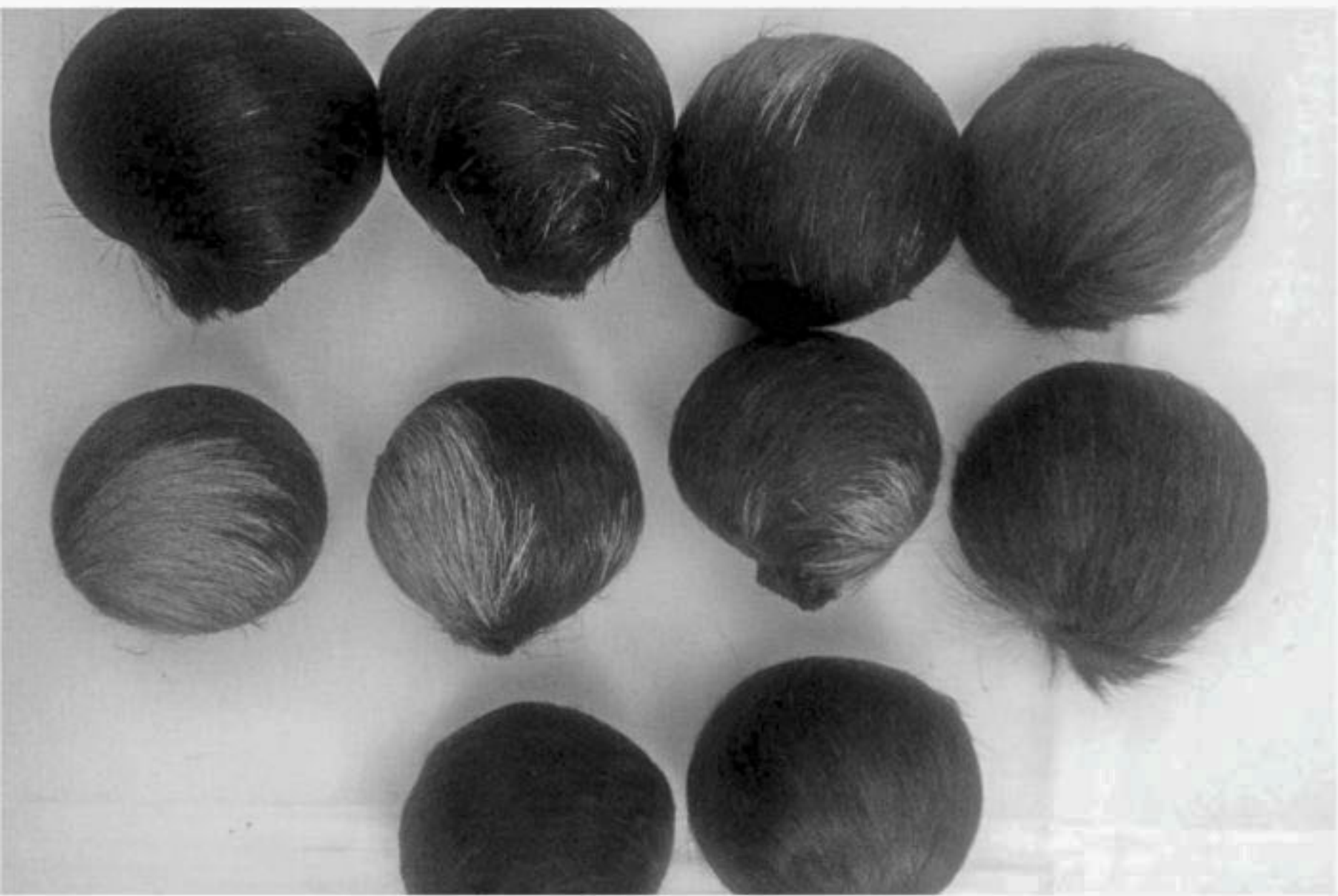
Ten musks seized by Border Guard Bangladesh in Hakimpur upazila under Dinajpur district on Friday night.

Earlier on November 7 last year, the BGB men seized 85 deer musks worth about Tk 1.7 crore from Panchbibi upazila in Joypurhat district.