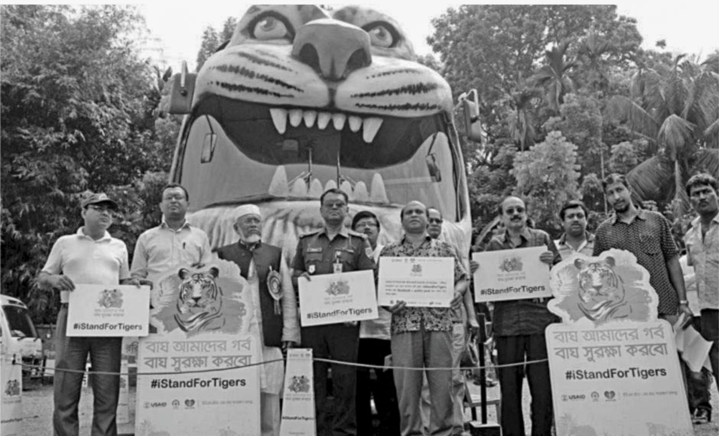
A high-tech coach decorated with the artistic representation of a tiger reaches Bagerhat town yesterday as part of a 100-day countrywide awareness campaign with the TigerCaravan starting from the capital Dhaka on February 11. WildTeam has organised the programme with the financial cooperation of USAID.