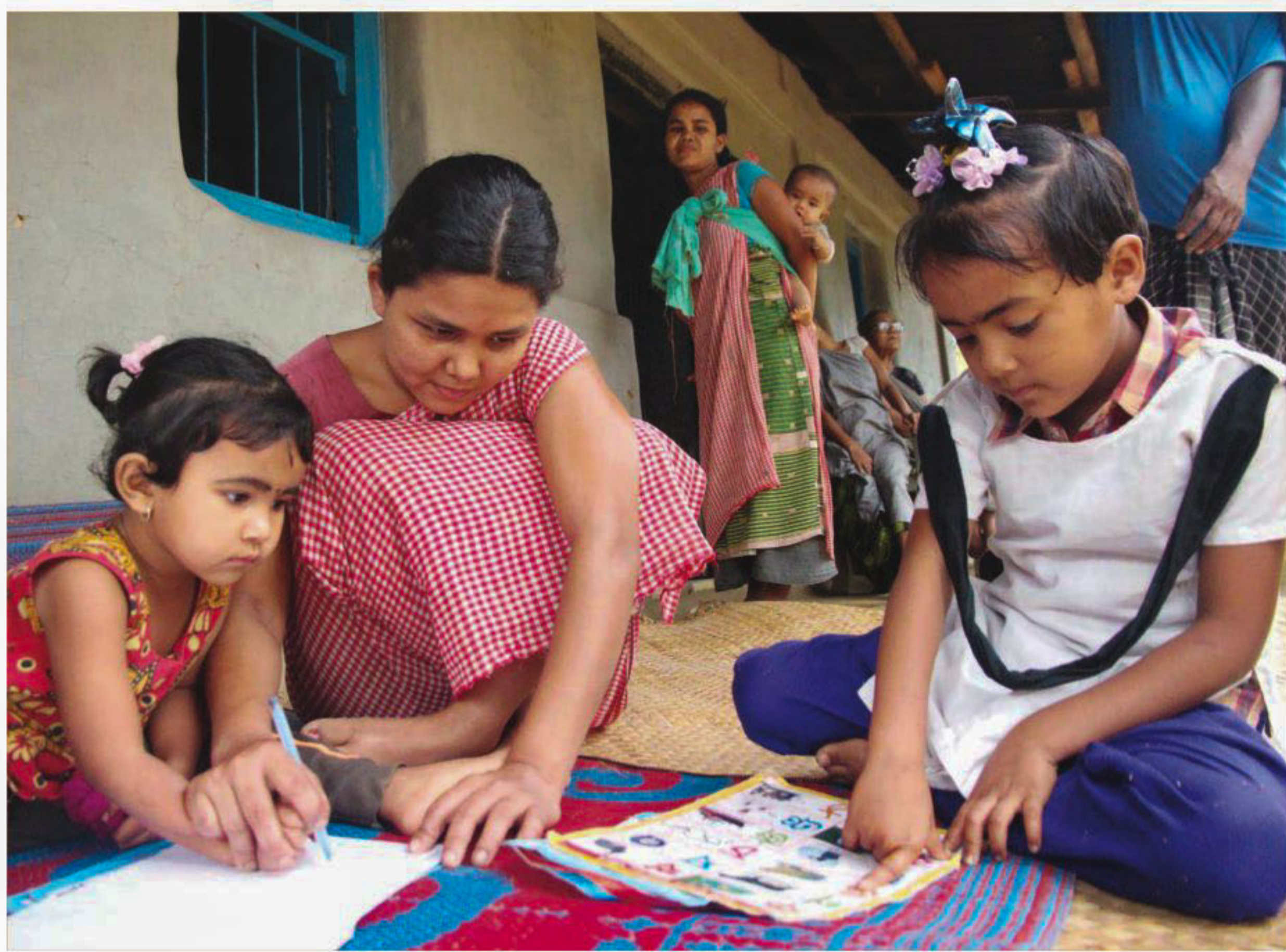
A Khasi woman teaching her children at her house at Pallathal Punji in Baralekha upazila of Moulvibazar. Some 50 Khasi families of the indigenous neighbourhood have been in fear of losing their homestead to India once the implementation of Land Boundary Agreement begins in their area. Locals said India would be in possession of about 300 acres of land where Khasis cultivate betel leaf. Top right , a youth working at the betel leaf garden. Bottom right , a placard demanding that the entrance to the gardens remain open to them.