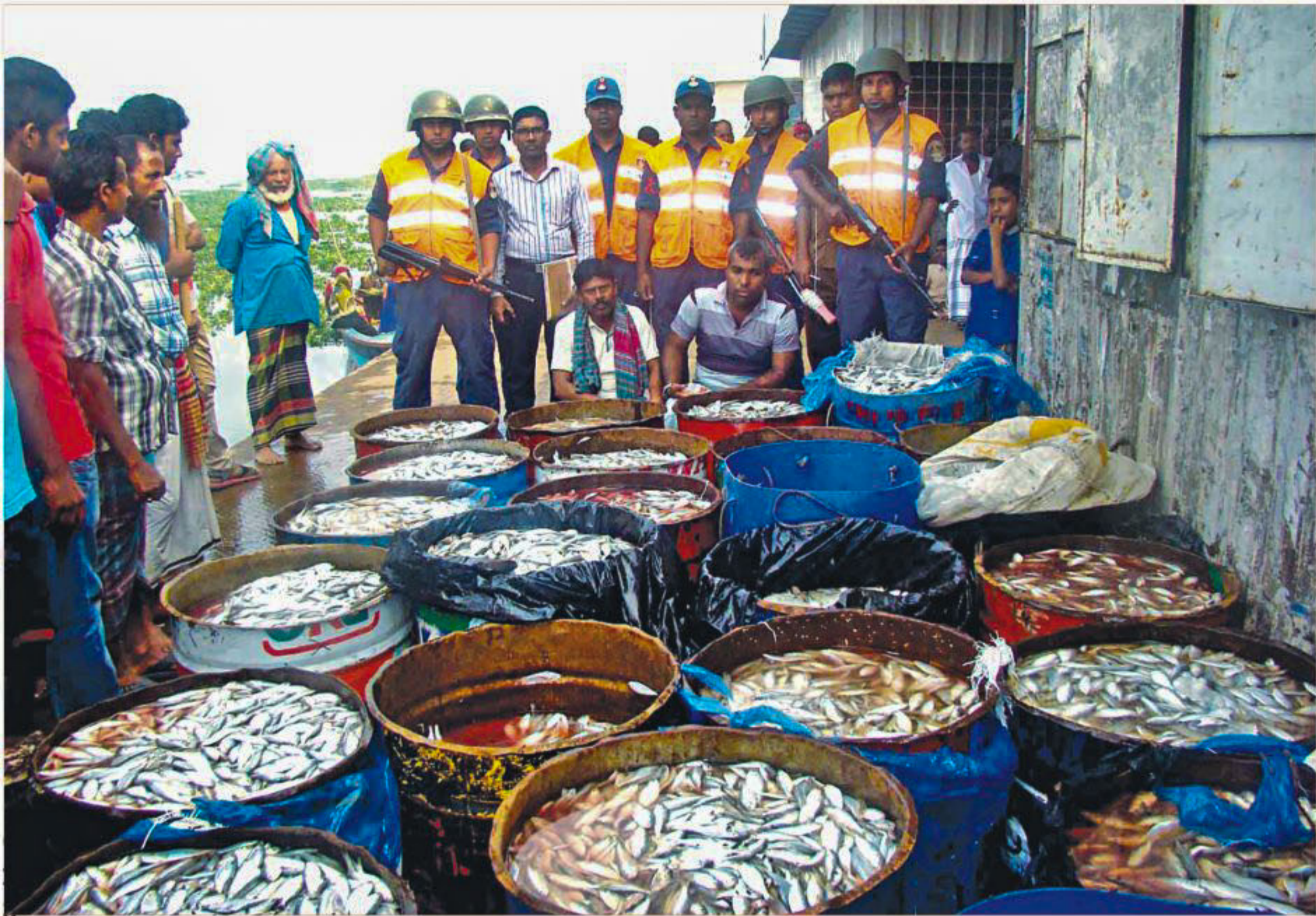
Seized hilsa fries on display at Gozaria Launch Terminal in Munshiganj yesterday. A team of Bangladesh Coast Guard seized the consignment of 2.5 tonnes of hilsa fries from the Dhaka-bound MV Prince of Russell Plus and arrested two launch staff.