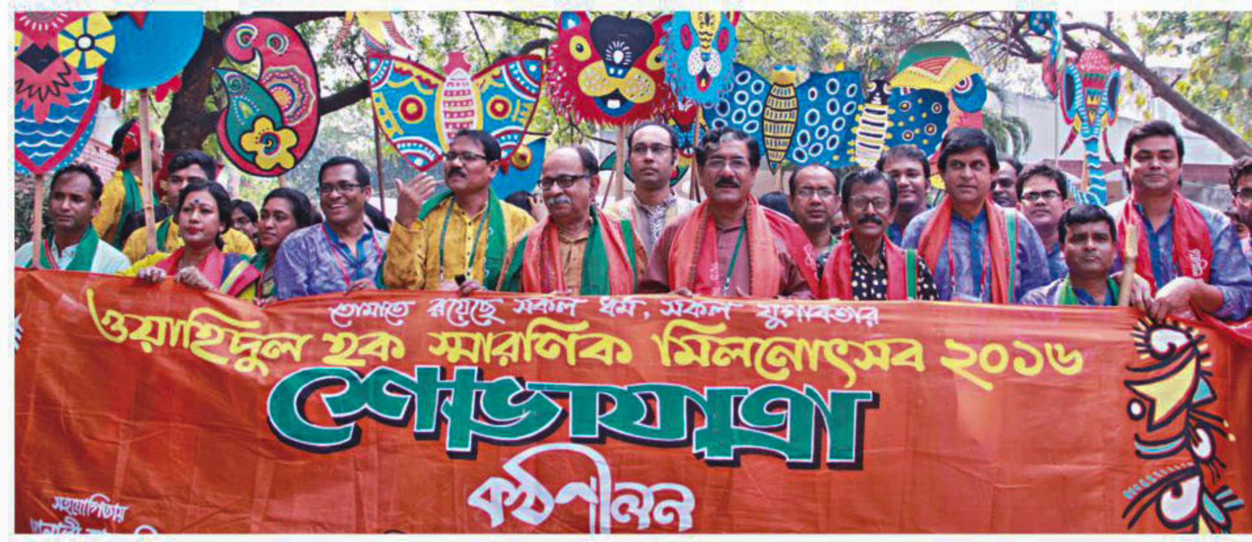
Guests and organisers at the colourful rally.