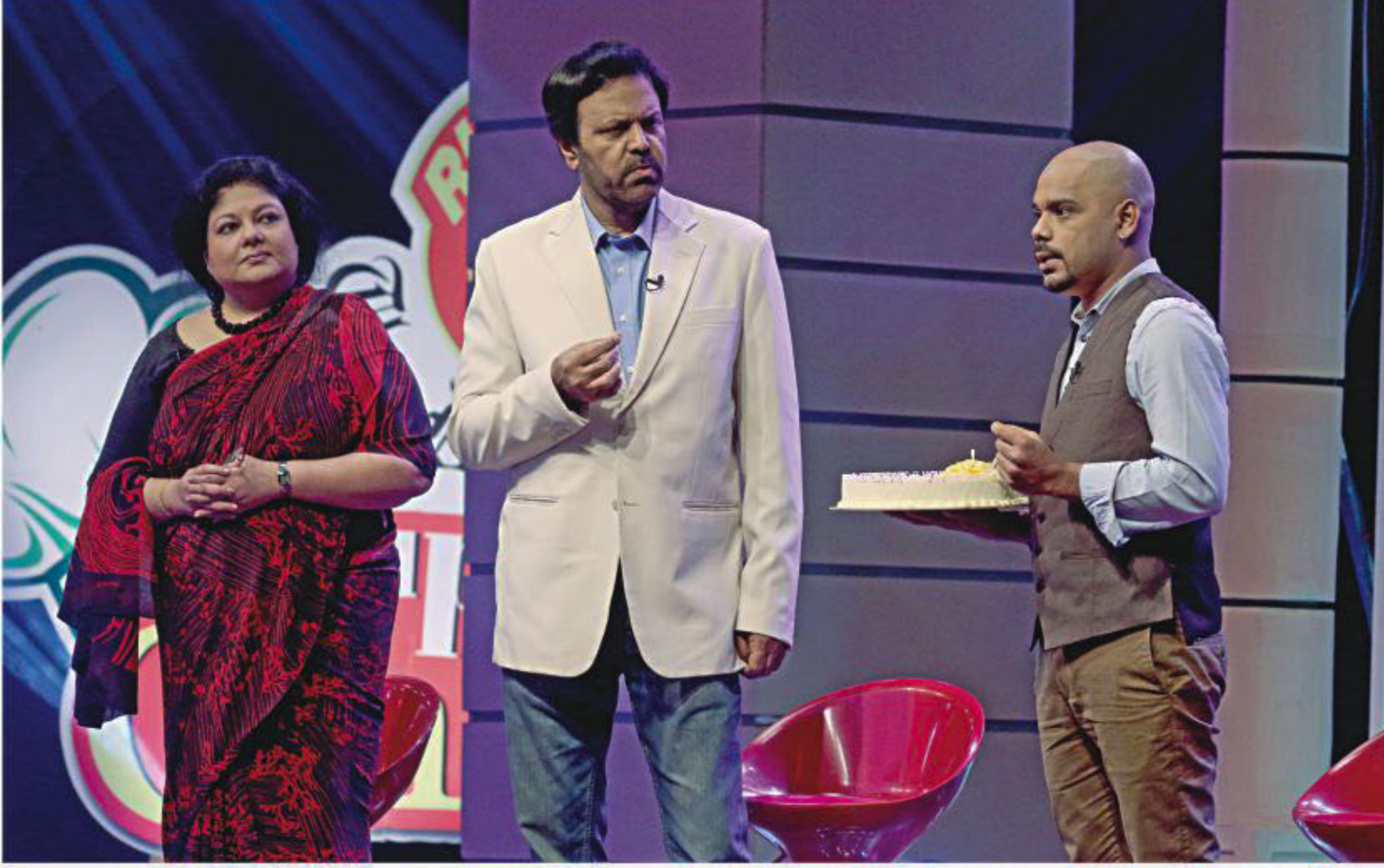
The judges deliberate on a participant's dish.

This week, in the third and fourth episode of Rupchanda-The Daily Star Superchef season 3. Keep your eyes on ntv every Saturday and Sunday at 9pm and catch the most prestigious cooking competition in the country. To take part in the Superchef Quiz, flip to page 4.