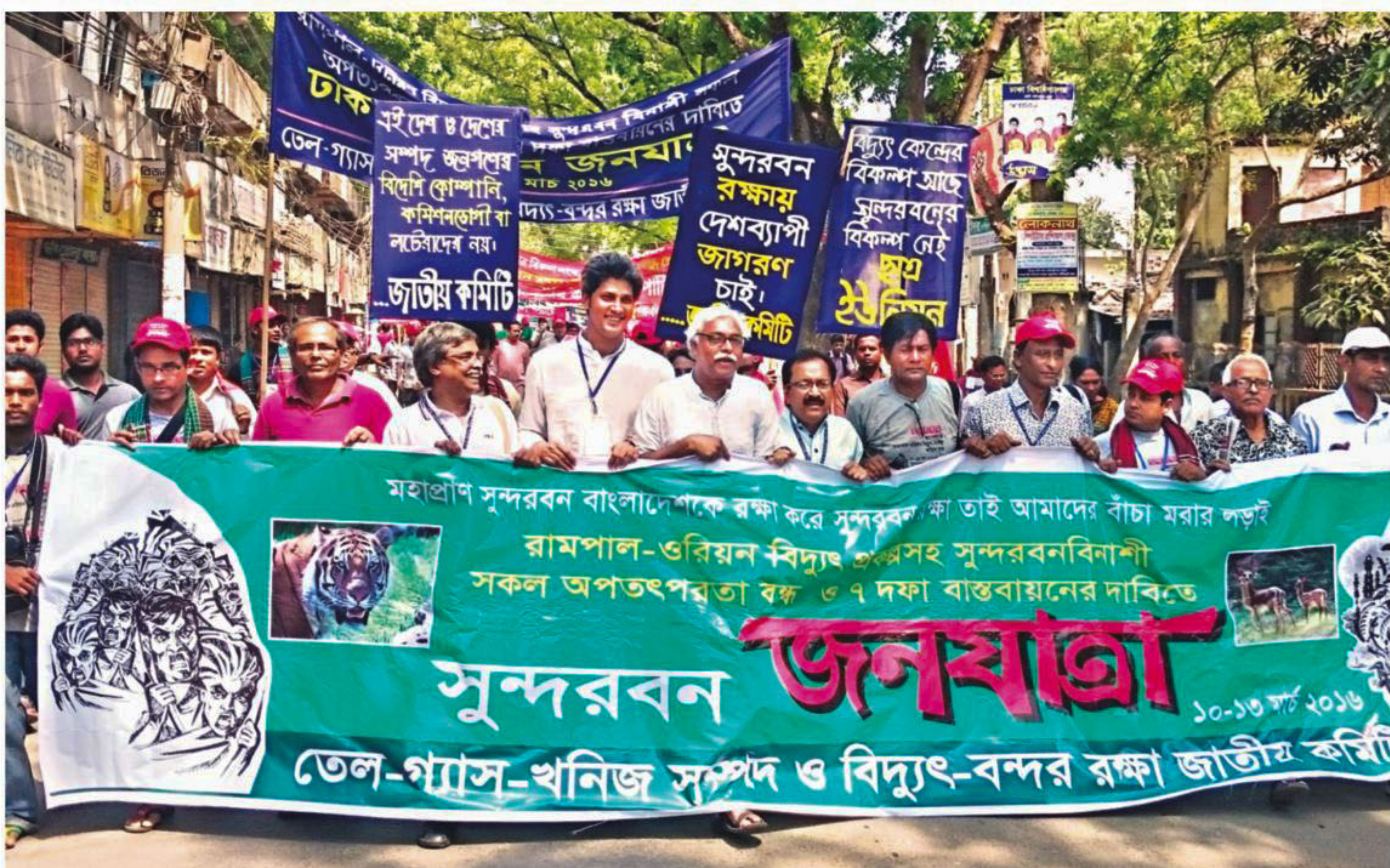
The long march of the National Committee to Protect Oil, Gas, Mineral Resources, Power and Ports reaches Magura town around 11:00am yesterday after it started towards the Sundarbans from the capital's Jatiya Press Club the day before demanding that the proposed Rampal power plant project near the forest be cancelled and it be protected from any further disasters.