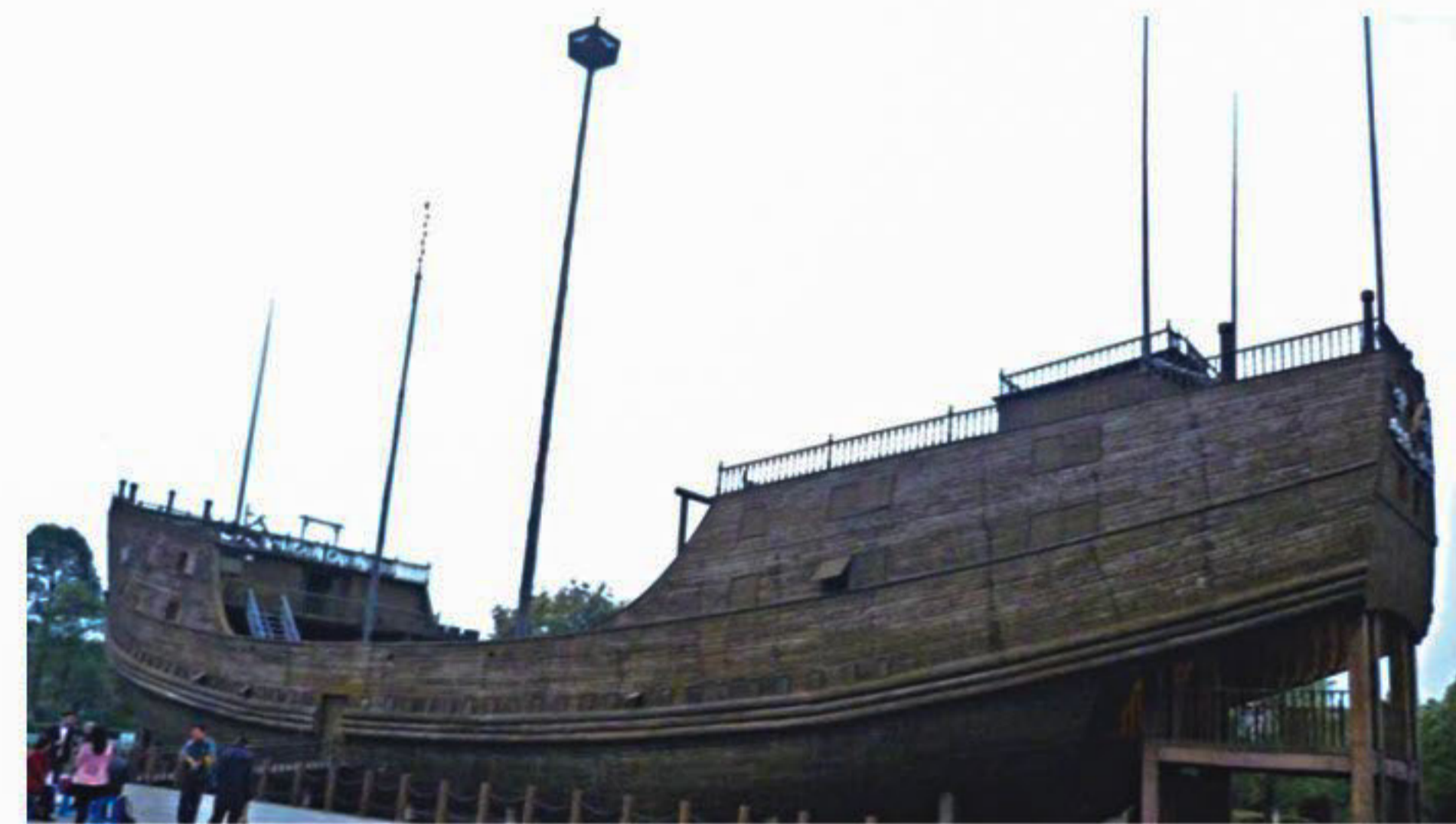
The Zheng He Treasure Ship Heritage park.