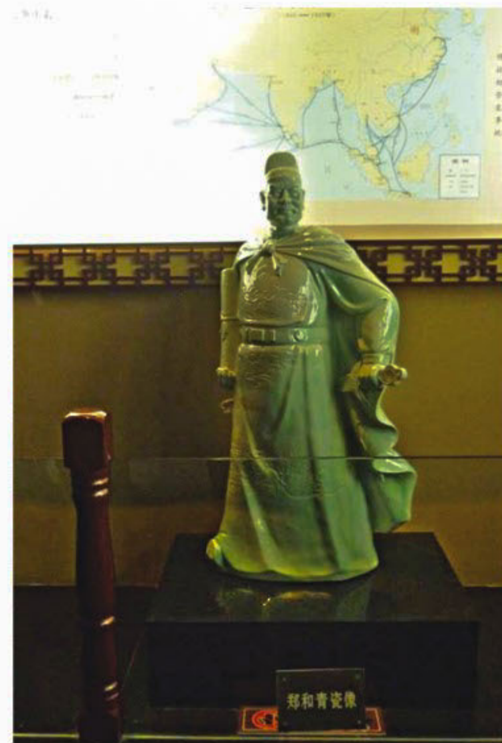
Statuette of Zheng He, the explorer.

albeit chilly, air filling my lungs, organised architecture, and a background view of mountains and blue waters to die for everything welcomed me humbly.