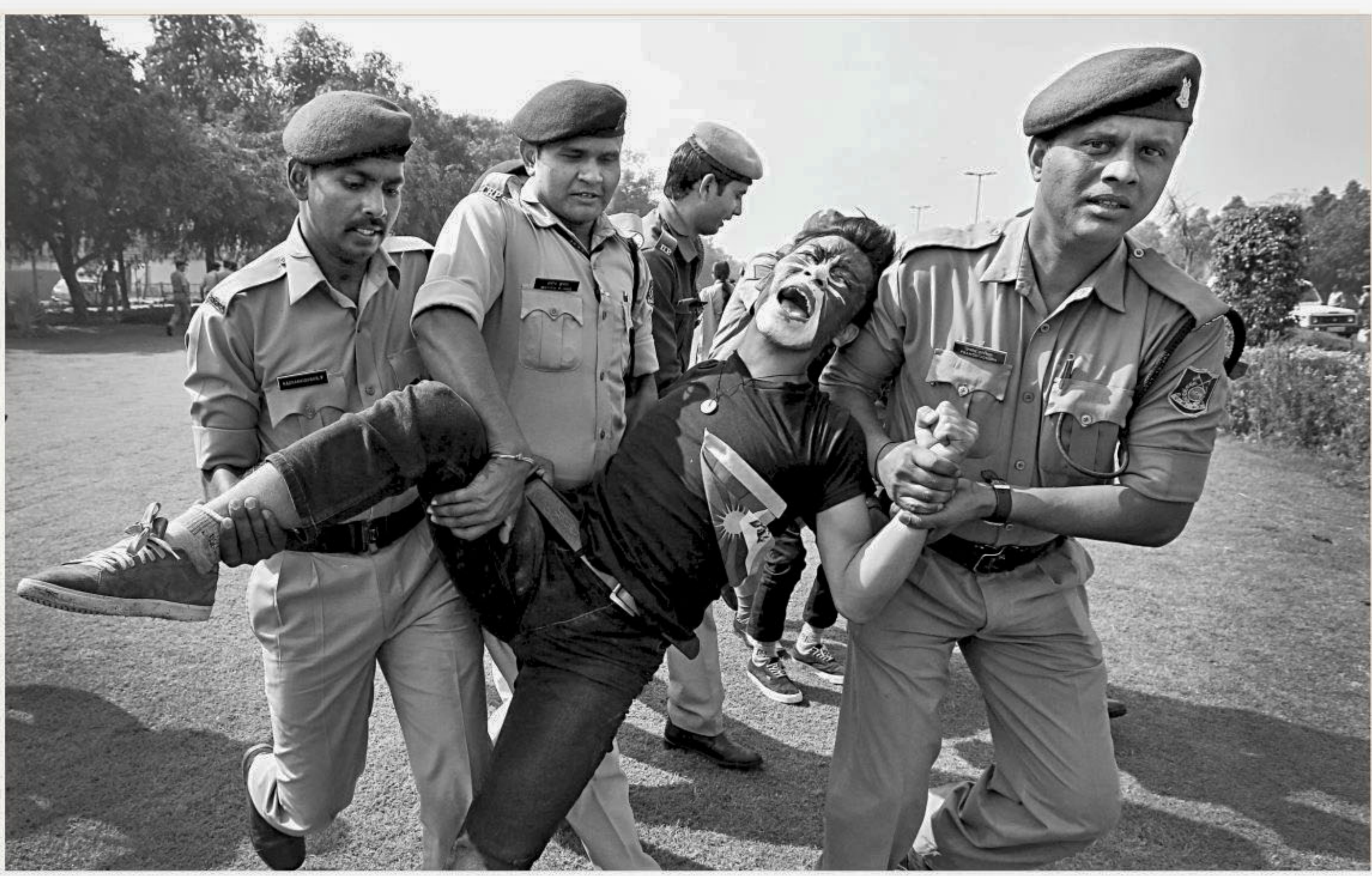
Indian police detain a Tibetan activist during a protest held to mark the 57th anniversary of the Tibetan uprising against Chinese rule, outside the Chinese embassy in New Delhi, India, yesterday.

AFP, Caracas President Nicolas Maduro on Wednesday recalled Venezuela's top diplomat from the US in protest against the renewal of a year-old US decree calling his country a security threat. US and Venezuela have been without ambassadors in each other's capitals since 2010. Relations between the two countries are typically tense, with Caracas often accusing Washington of imperialist meddling in Latin America.