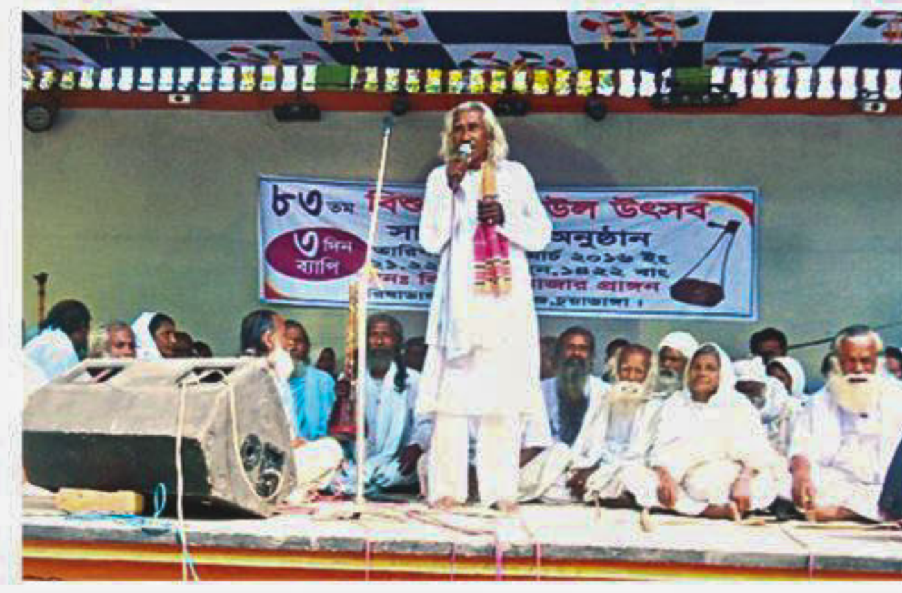
A baul performs at the festival.