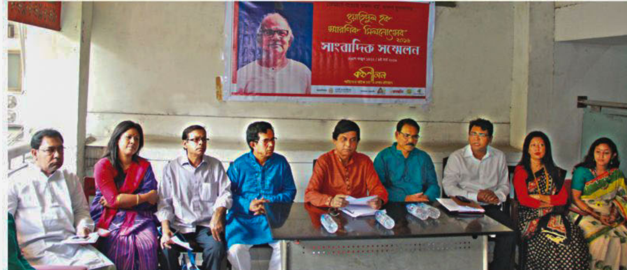
Speakers at the press conference.

EMMANUEL LUBEZKI consecutive three-time Oscar winning cinematographer.