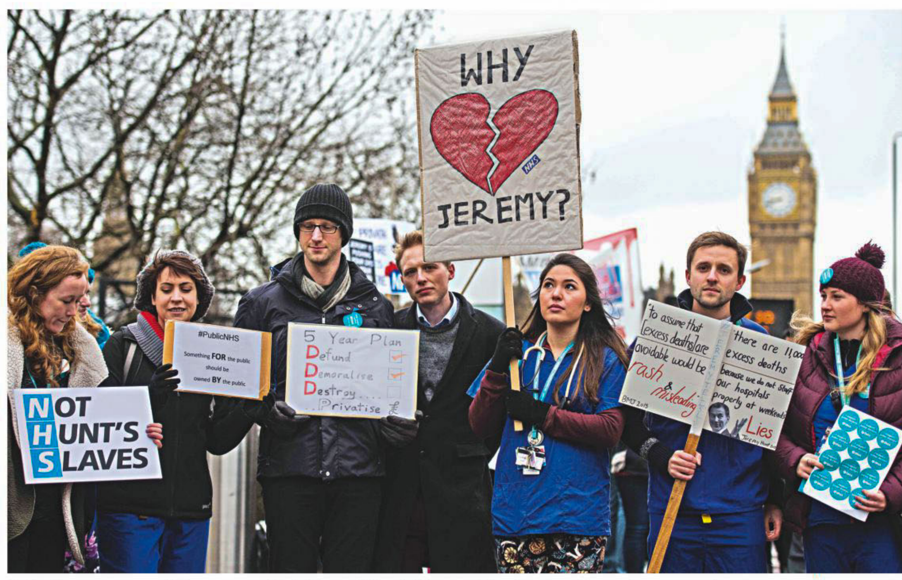
Junior doctors protest with banners outside St Thomas' Hospital in central London yesterday, against proposed new conditions and pay rates for working unsociable hours. Thousands of operations and procedures across England have been cancelled as a result of the 48 hour strike which began Wednesday morning.

AFP, London Buckingham Palace hit out yesterday at a report which claimed Queen Elizabeth II is in favour of Britain leaving the European Union. The Sun, Britain's most-read newspaper, put the headline "Queen backs Brexit" on its front page with a photograph of the monarch, with the sub-heading "EU going in wrong direction, she says". Britain is due to vote on June 23 on whether to remain a member of the 28-member European Union.