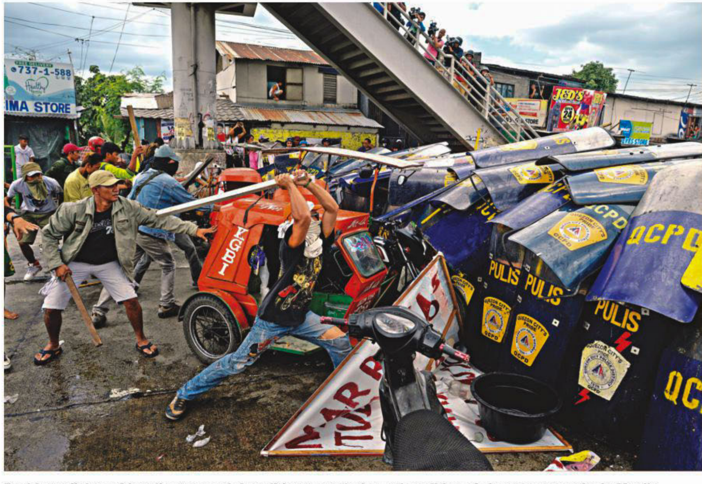
Residents fights with policemen and demolition team during a demolition of shanty community in Manila, yesterday. Shantytowns dot the Philippine capital where many of the city's poor are forced to reside.