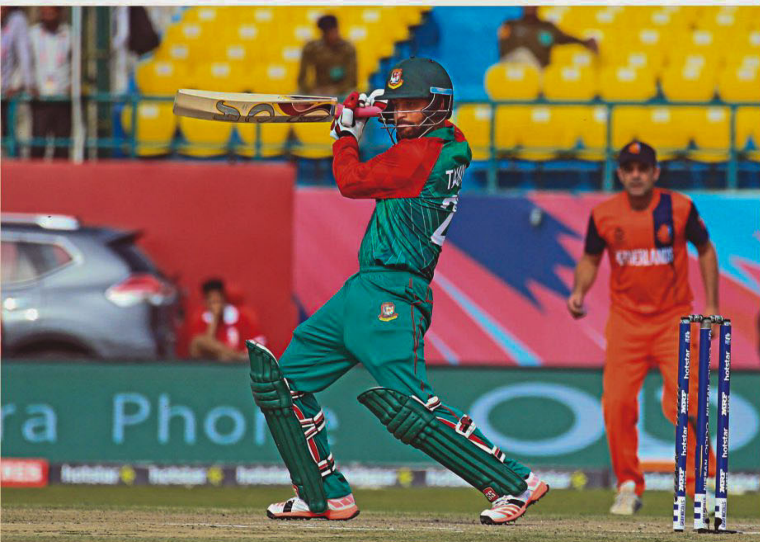
Bangladesh opener Tamim Iqbal rocks back to smash one through point during his 58-ball 83 against the Netherlands yesterday. Tamim, who smashed six fours and three sixes, was the only effective Bangladeshi batsman as the Tigers won their first ICC World Twenty20 qualifying match in Dharamsala by eight runs.