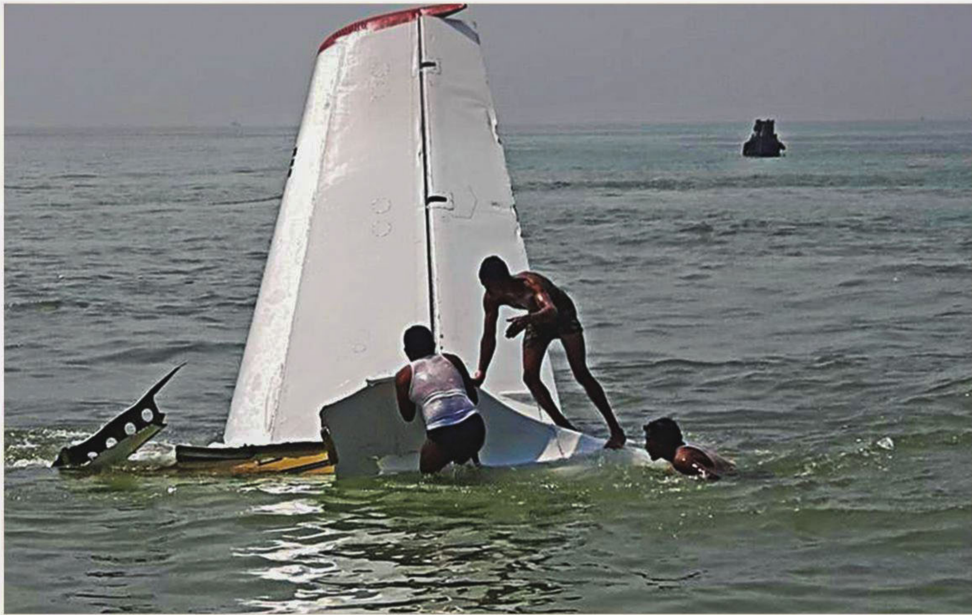
Rescuers looking for victims in the floating debris of a cargo plane that crashed in the Bay of Bengal off Sonadia island yesterday on its way to Jessore from Cox's Bazar. Three of its four crew were killed in the accident.