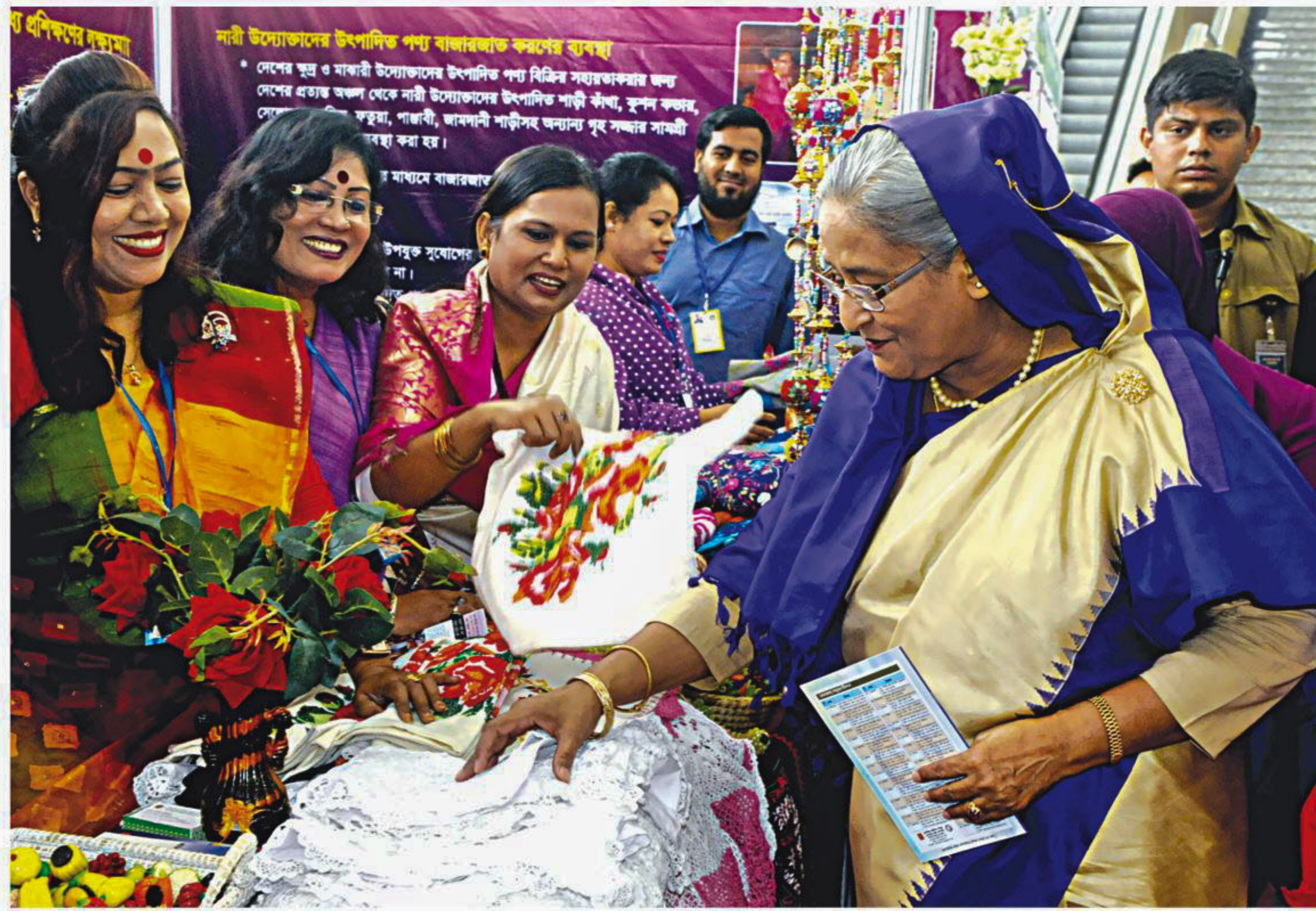
Prime Minister Sheikh Hasina browses products made by women at a stall at the city's Bangabandhu International Conference Centre yesterday. The producers set up the displays as part of a programme on the occasion of the International Women's Day.