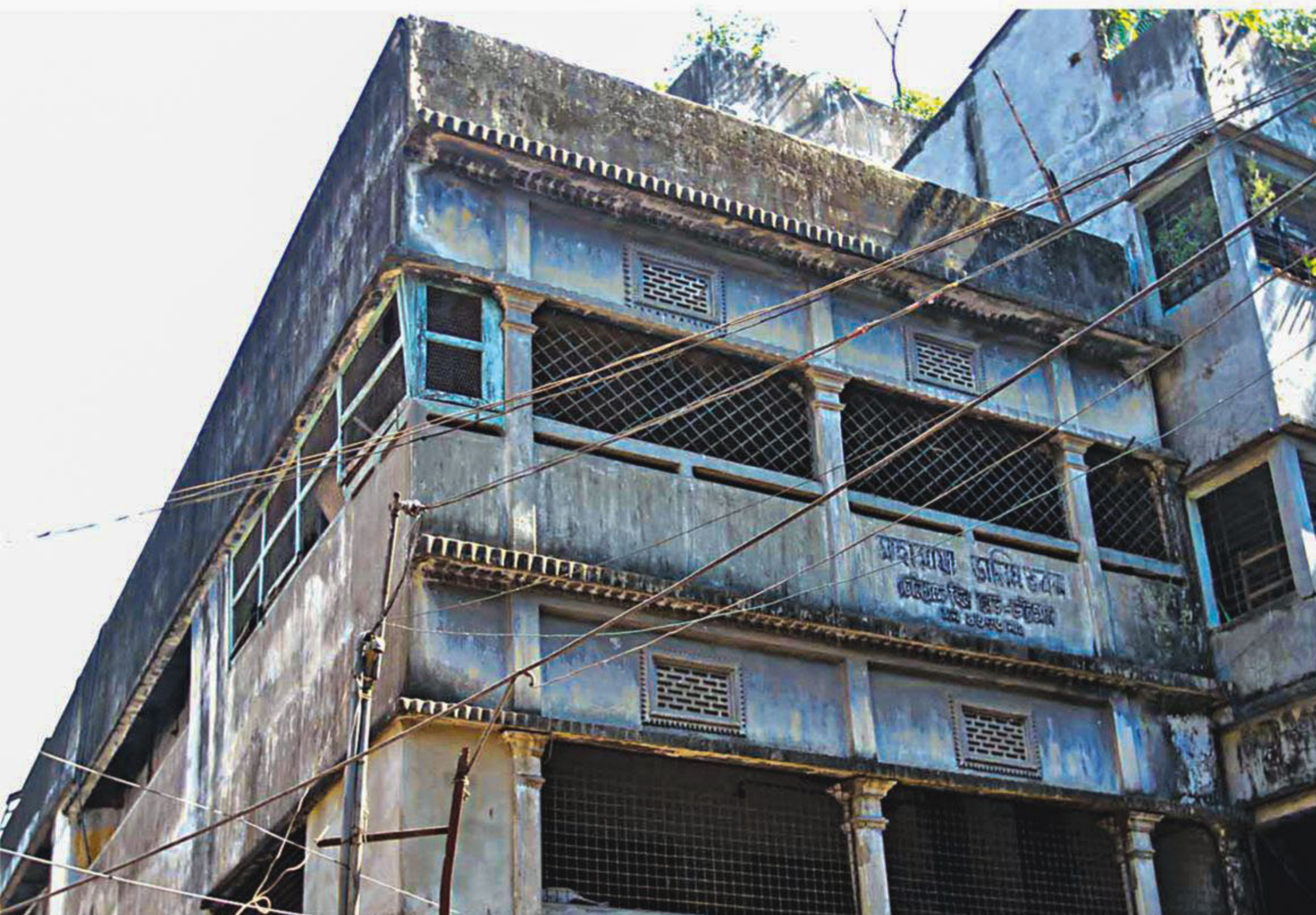
This nondescript three-storey building, the Mahamaya Dalim Bhaban at Anderkilla, in Chittagong was the headquarters and torture chamber of the Al-Badr in the district in 1971. Led by Mir Quasem Ali, Al-Badr men took over the building during the Liberation War and used it to confine, torture and kill freedom fighters and pro-liberation people. Quasem's death sentence was upheld by the Supreme Court yesterday.