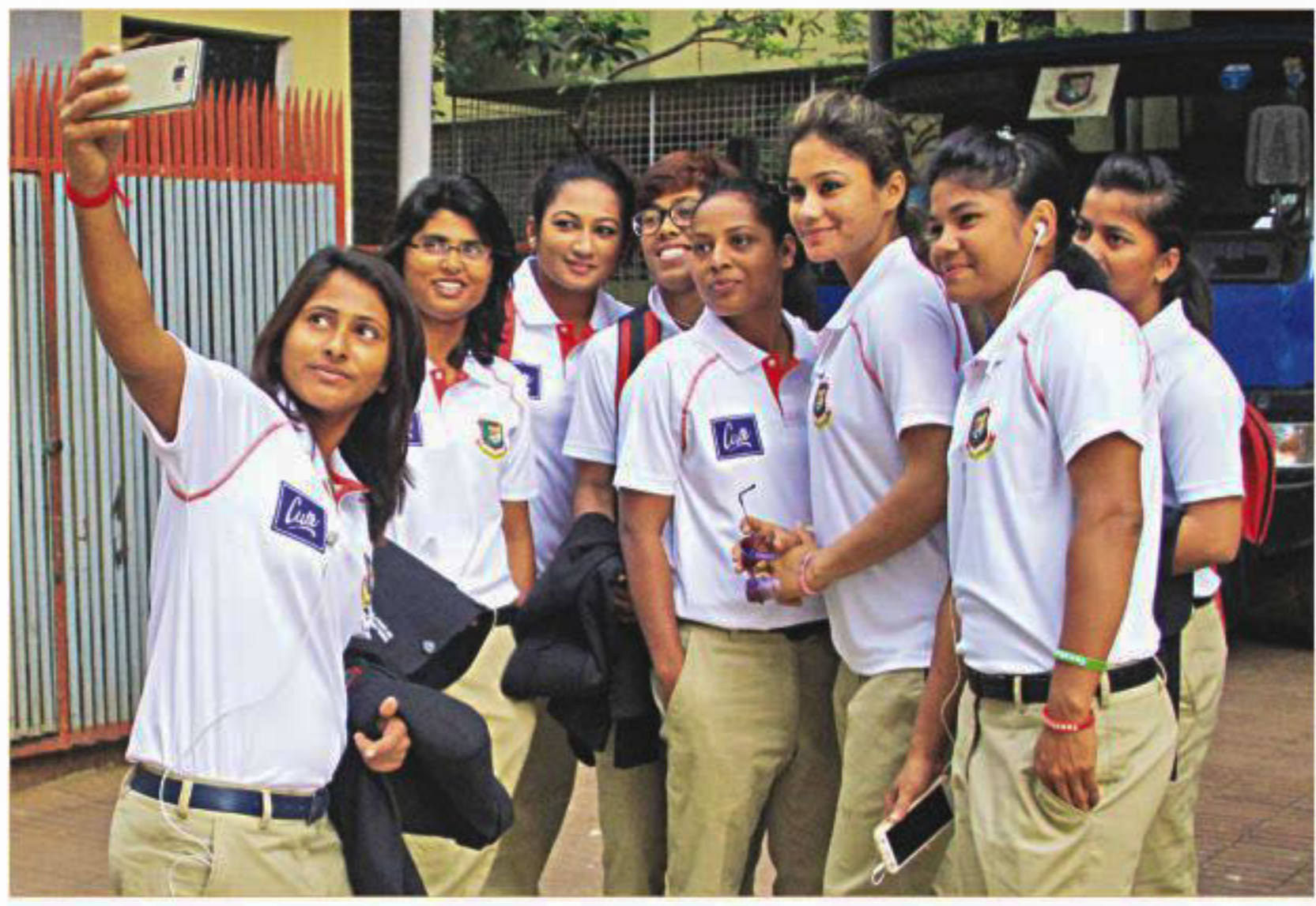
Bangladesh national women's cricket team take a group selfie at the Sher-e-Bangla National Stadium prior to their departure for Bangalore where they will be playing their first two World Cup fixtures.

With the team on the right track, a bit more perseverance can do wonders for them in the coming years. But in order to do that, they need to play more international matches. And that can only happen if they can make a statement, which is precisely what they aim to do in India.