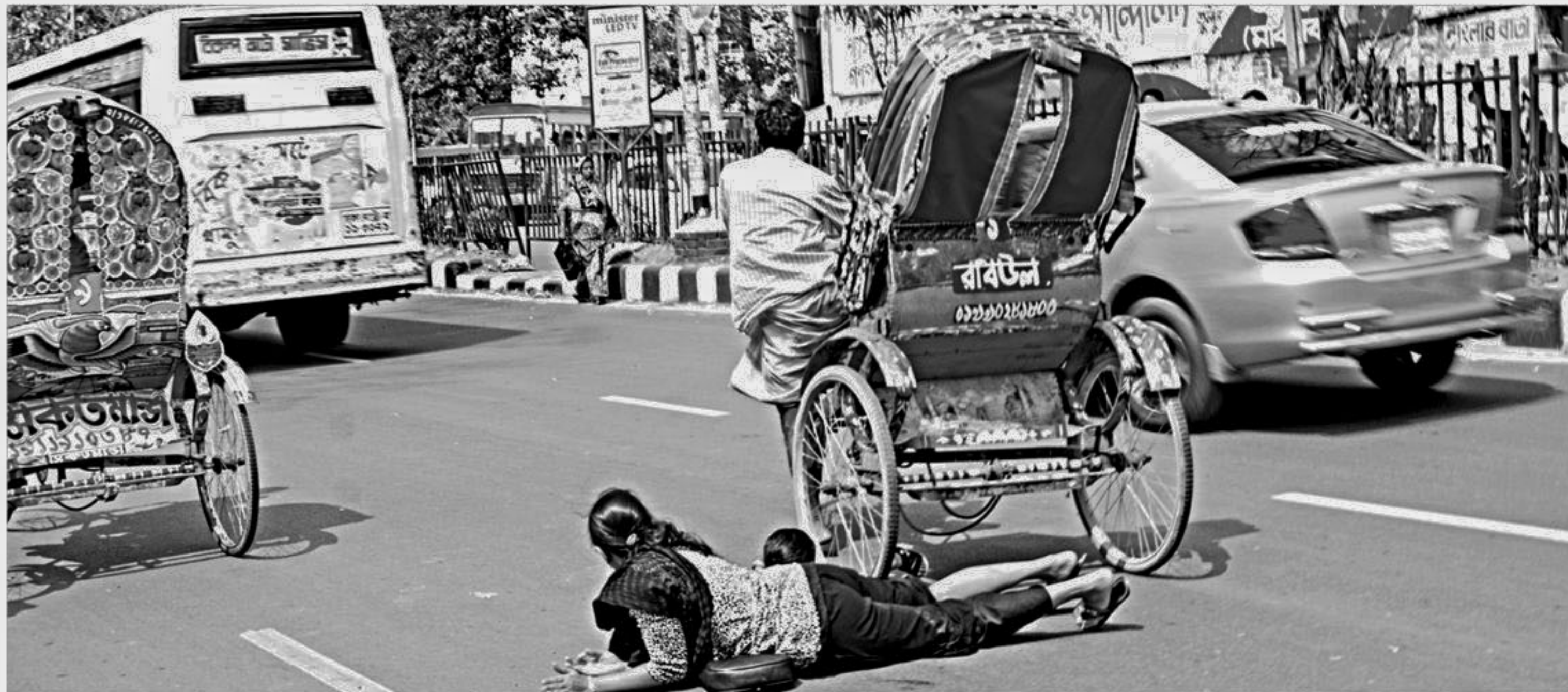
A woman and a child lie helplessly on the street after falling off a rickshaw, due to the reckless driving of a speeding bus, which caused the puller to lose his balance. The wheel of the rickshaw went over their legs, leaving them critically injured. Despite the road safety awareness campaigns, the traffic situation in the capital is worsening, especially because of the bus drivers; most of whom are unlicensed and have little to no knowledge about traffic rules and road safety. The photo was taken yesterday in front of Jatiya Press Club.