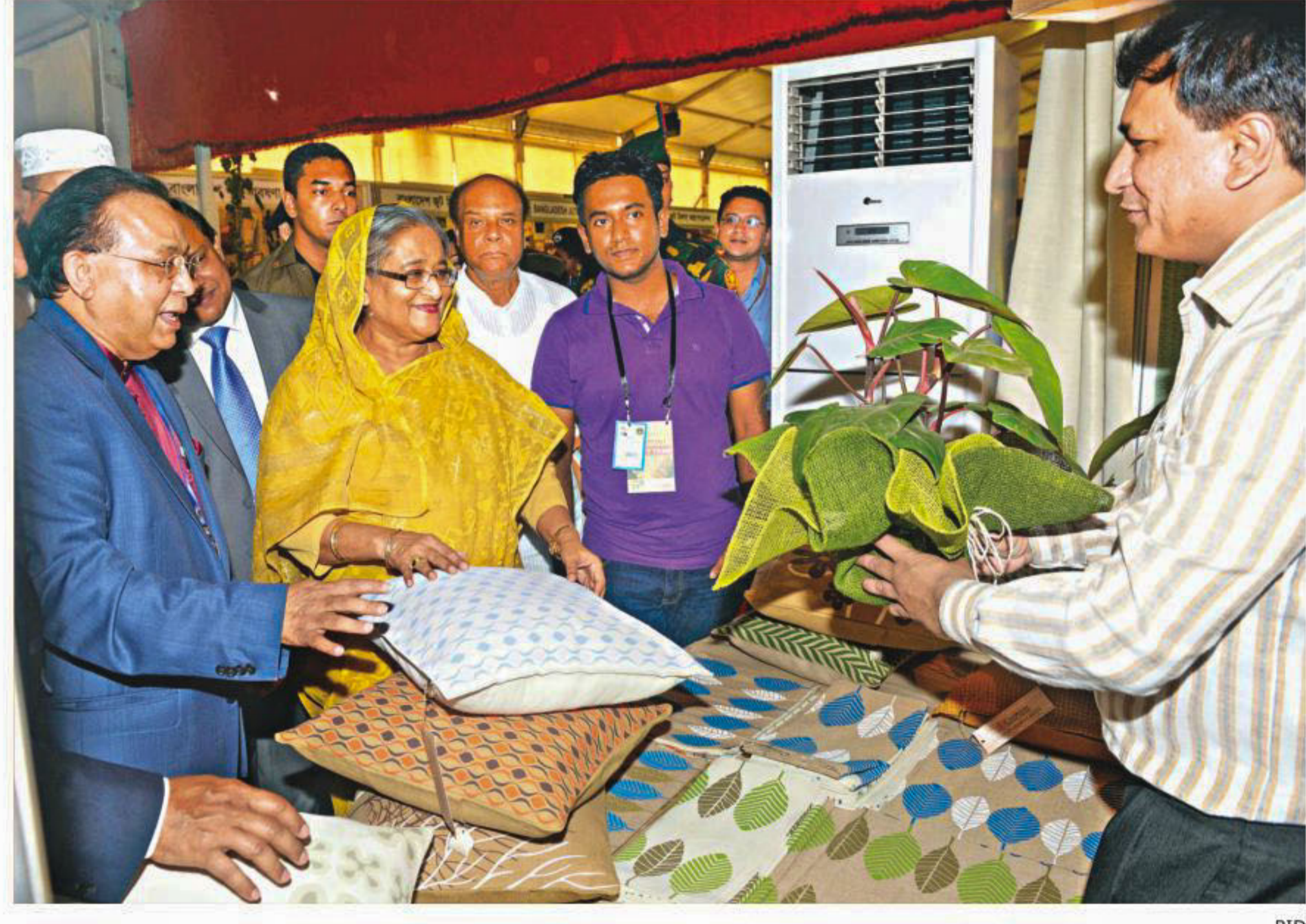
Prime Minister Sheikh Hasina visits a stall of products made of jute at a three-day fair at Bangabandhu International Conference Centre in the capital yesterday. Story on B3