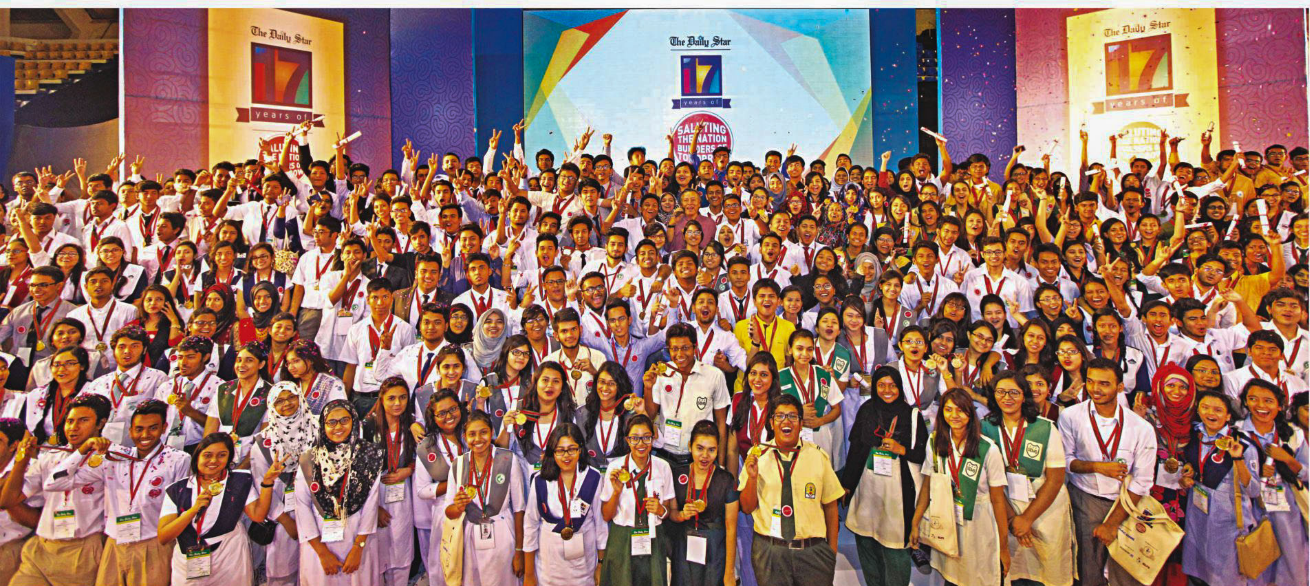
Some of the 1,915 high achievers of the O- & A-levels in country pose for a group photo at the Shaheed Suhrawardy National Indoor Stadium in Mirpur during The Daily Star 17th O- & A-Level Awards Presentation Ceremony yesterday.