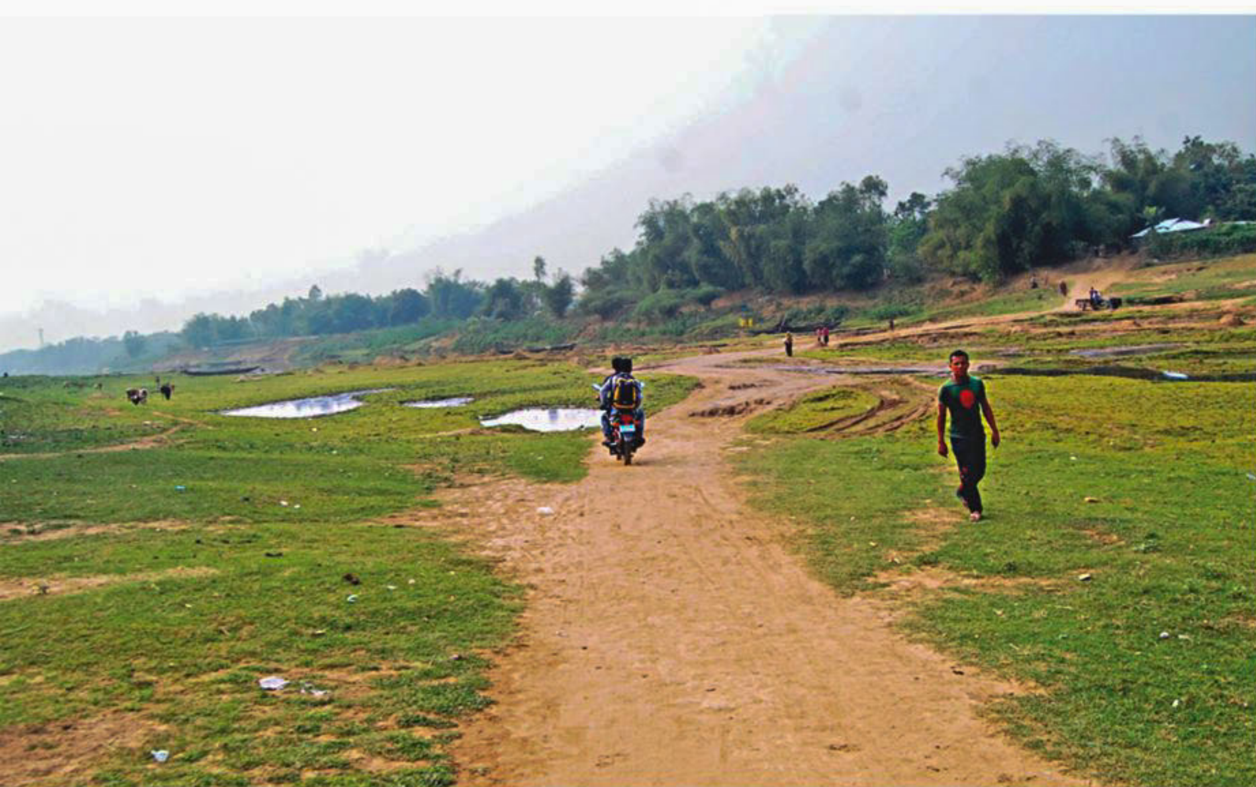
A ROAD? ... A motorbike travelling on what appears to be a dirt road in Sylhet's Jaintapur upazila. But it actually is a river named the Boro Gaang, which is almost dead due to siltation. The photo was taken yesterday.