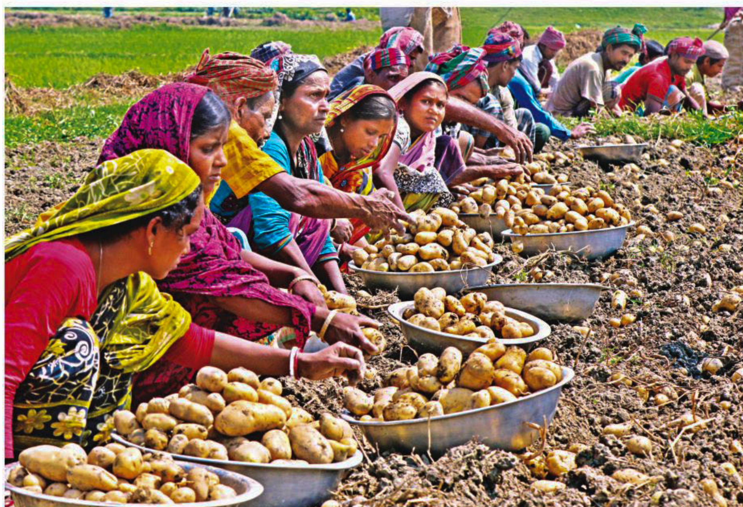
Workers harvesting potato in a farmland at Kotgaon in Munshiganj's Sirajdikhan yesterday. There has been a bumper production of potato in the district this year. However, last week's rain caused waterlogging in some fields and damaged portion of the yield.