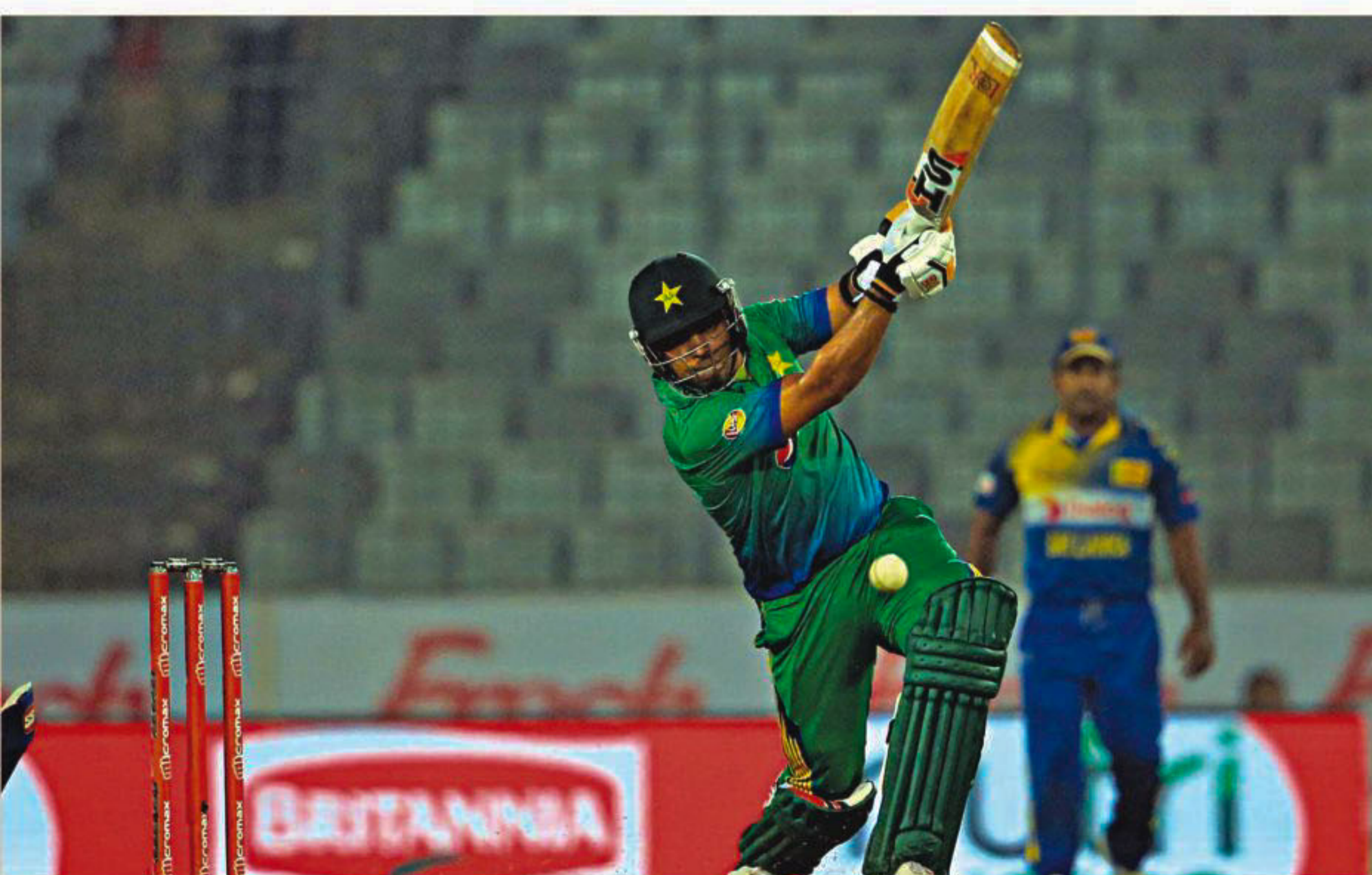
Pakistan pulled off the highest successful chase of this Asia Cup so far. Aided by Umar Akmal's 37-ball 48, which featured four 4s and two 6s, Pakistan reached the 151-run target set by Sri Lanka with six wickets and four balls to spare at the Sher-e-Bangla National Stadium in Mirpur yesterday.

May Allah embrace him with infinite mercy as He welcomes him to his eternal home. May he be blessed, and may we all be reunited with our beloved parents in the highest place in Jannah. Ameen.