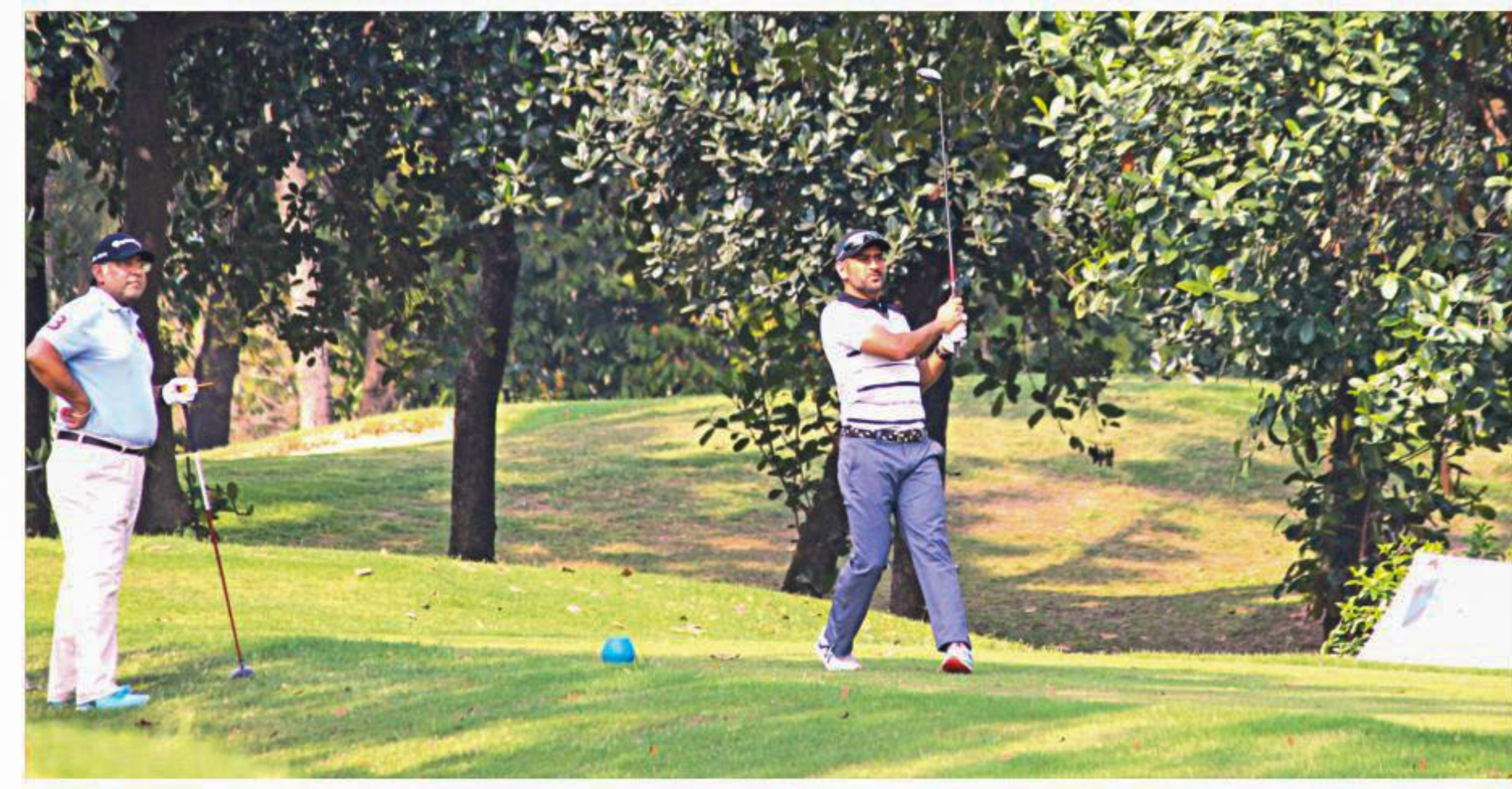
Having led his side to the final of the Asia Cup with an all-win record, India skipper Mahendra Singh Dhoni took time off from cricket and hones his golf skills at the Kurmitola Golf Club yesterday.