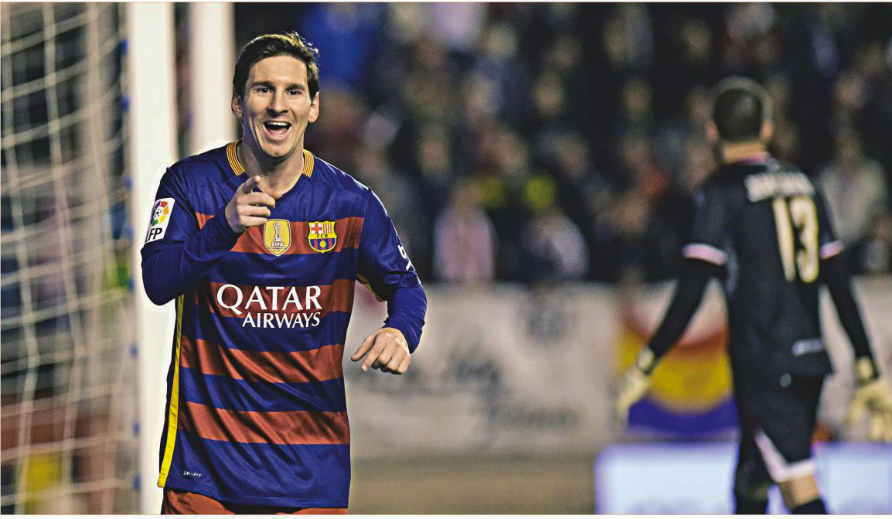
Barcelona's Argentine superstar Lionel Messi celebrates one of his three goals during Primera Liga match against Rayo Vallecano at the Vallecas Stadium in Madrid on Thursday.