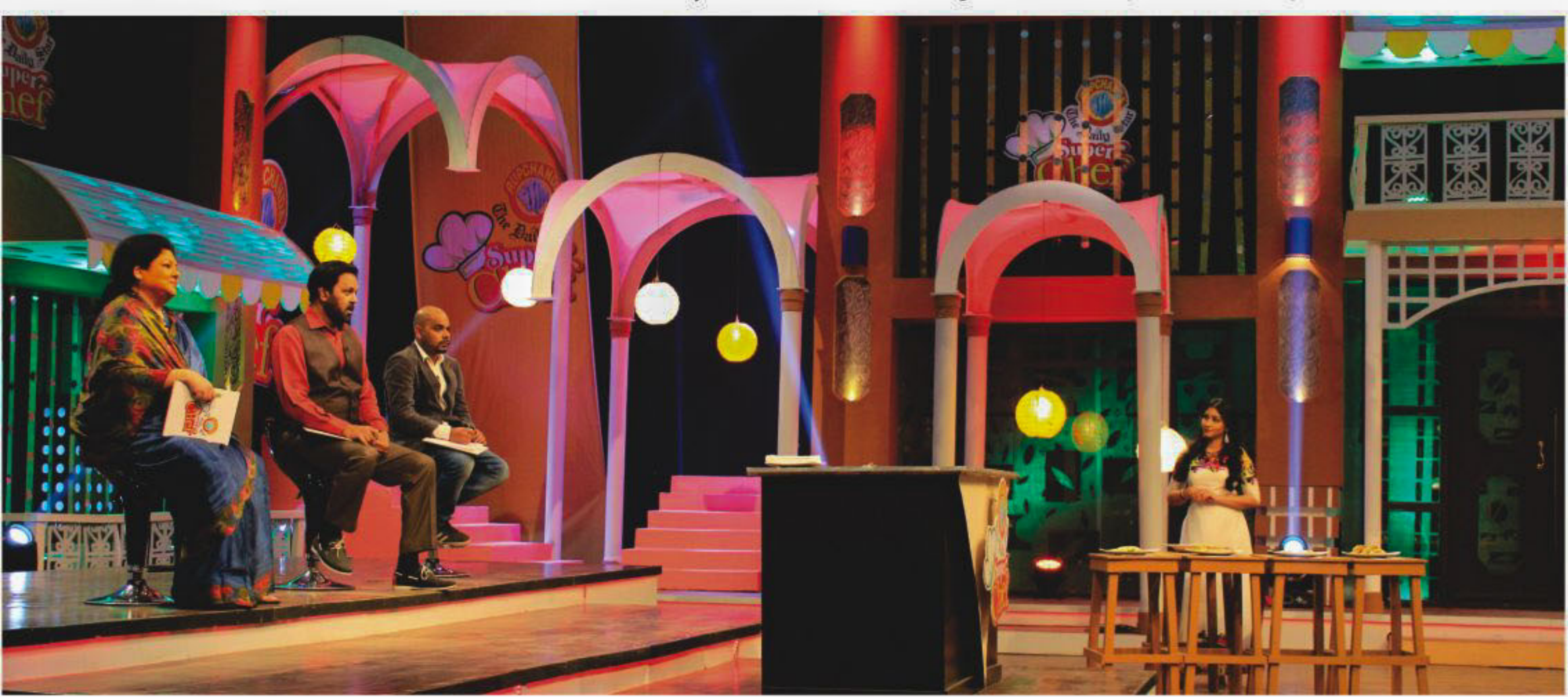
The judges are ready, and so are the contestants.