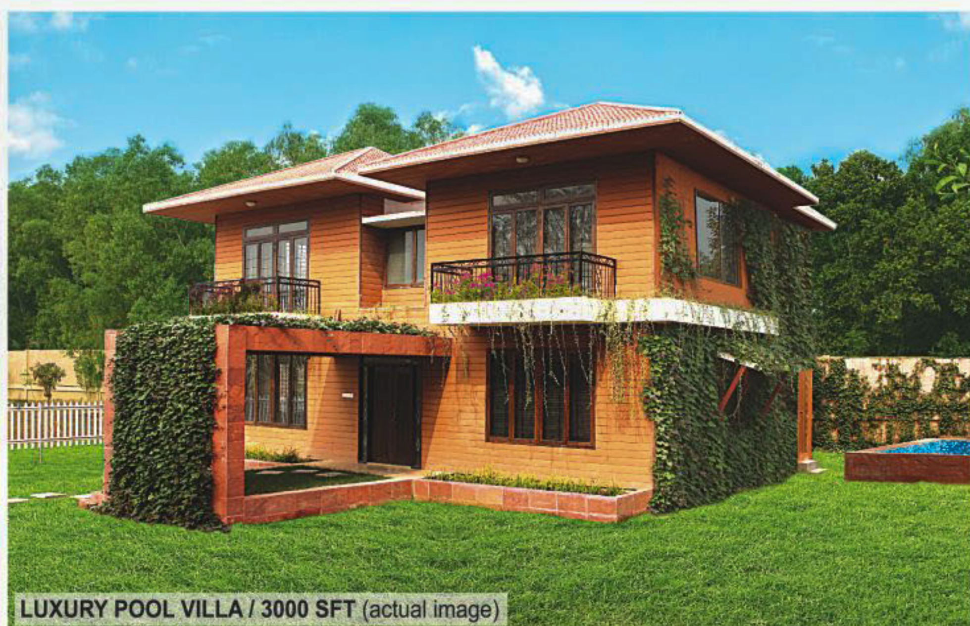
LUXURY POOL VILLA / 3000 SFT (actual image)