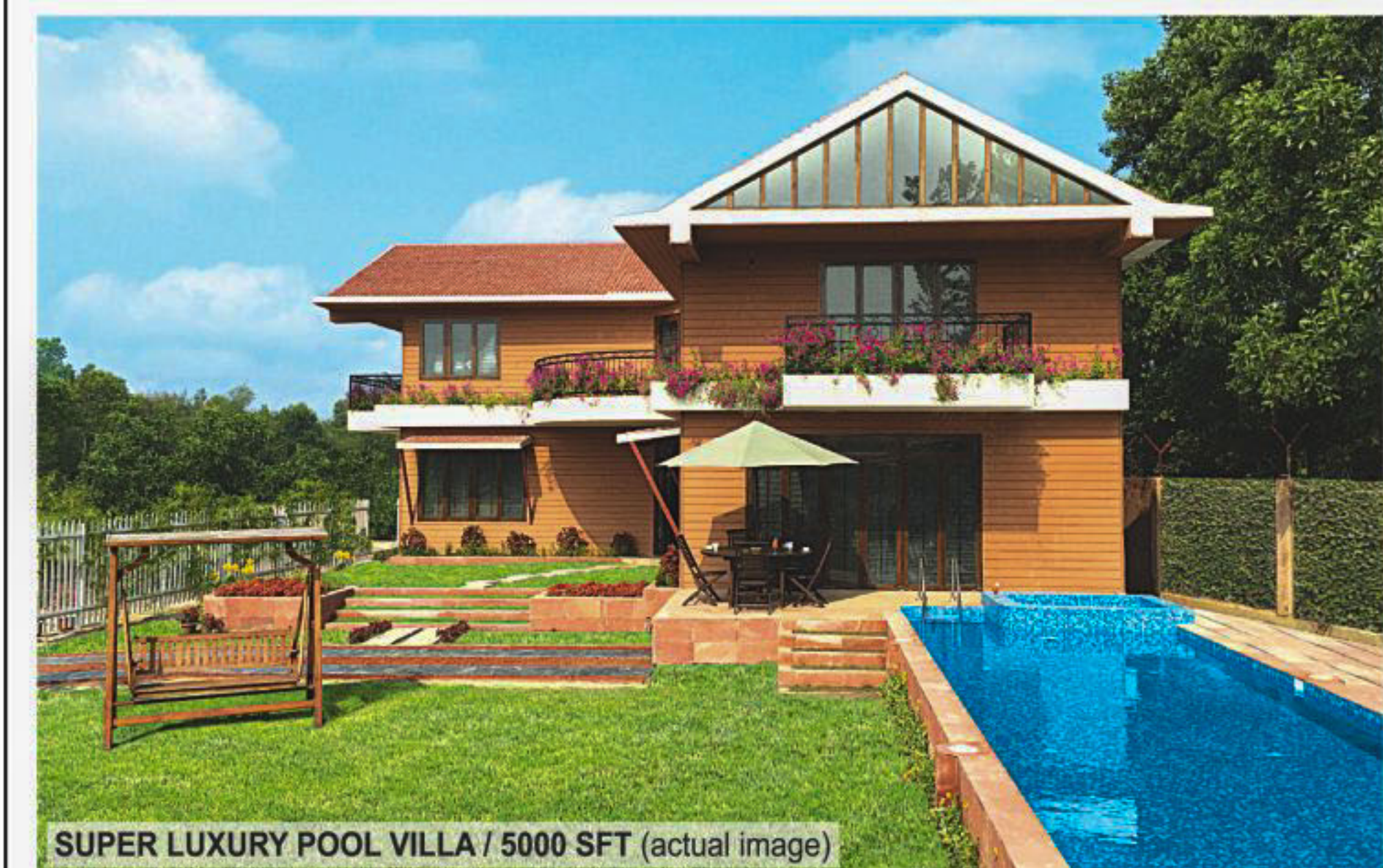
SUPER LUXURY POOL VILLA / 5000 SFT (actual image)