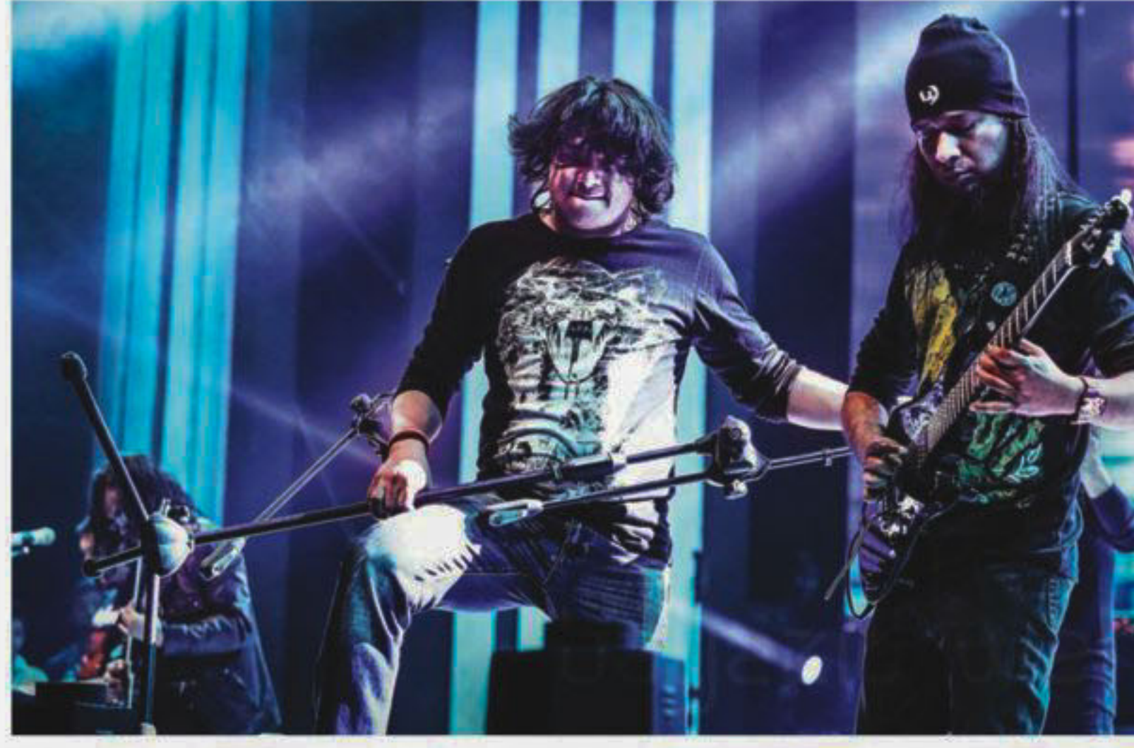
Warfaze is one of the most-anticipated bands at the concert.

STAFF CORRESPONDENT The long awaited youth centric concert of the year, "Joy Bangla Concert", is set to take place at the Army Stadium in the capital on March 7. Registration for the concert is open on http://ticket.youngbangla.org website. Youth organisation Young Bangla is organising the concert marking the date of Father of the Nation, Bangabandhu Sheikh Mujibur Rahman's historical March 7, 1971 speech. Leading bands Warfaze, Shironamhin, Arbovirus, Lalon, Cryptic Fate, Nemesis and Shunno will perform at the concert. Thousands of spirited youths will gather at the stadium to recall the day, and celebrate independence with Bangla rock music.