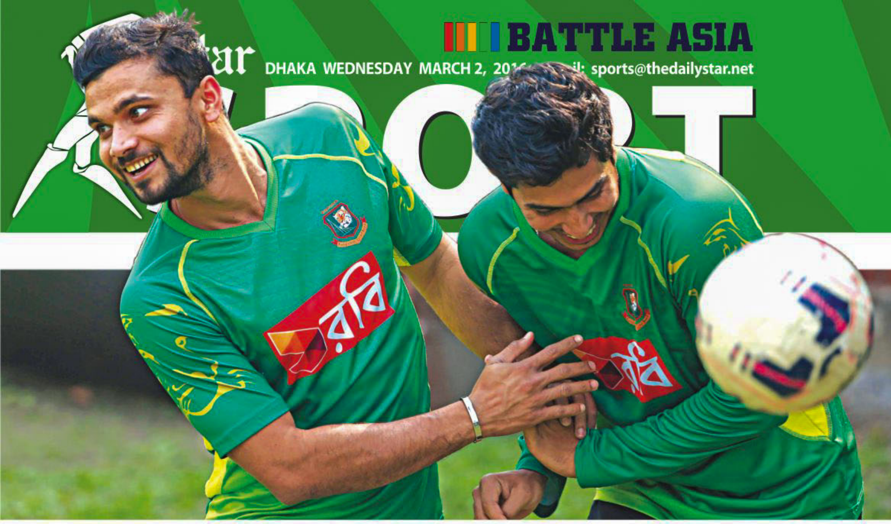
Bangladesh skipper Mashrafe Bin Mortaza shares a light moment in training with Soumya Sarkar at the BCB Academy Ground in Mirpur yesterday.