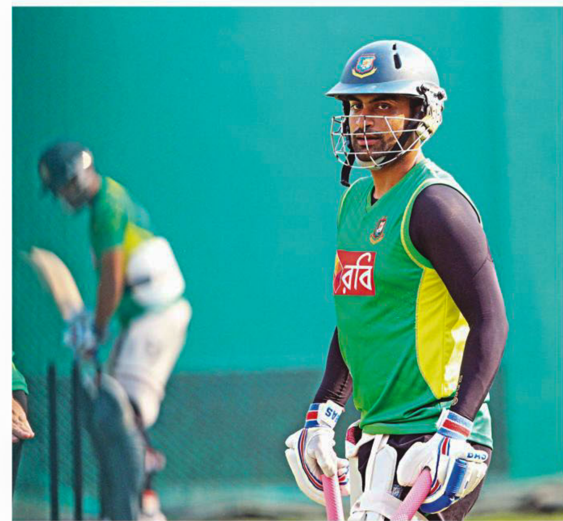
Dashing left-handed opener Tamim Iqbal will be looking to make an instant impact and resolve the top-order issues when Bangladesh take on Pakistan in a crucial Asia Cup T20 encounter in Mirpur today.

The cancellation though isn't bad news. The Tigers have been practicing for the last few months keeping in mind the seaming tracks in Dharamsala. That is also a reason why the Asia Cup has witnessed tracks that have had plenty of grass and bounce.