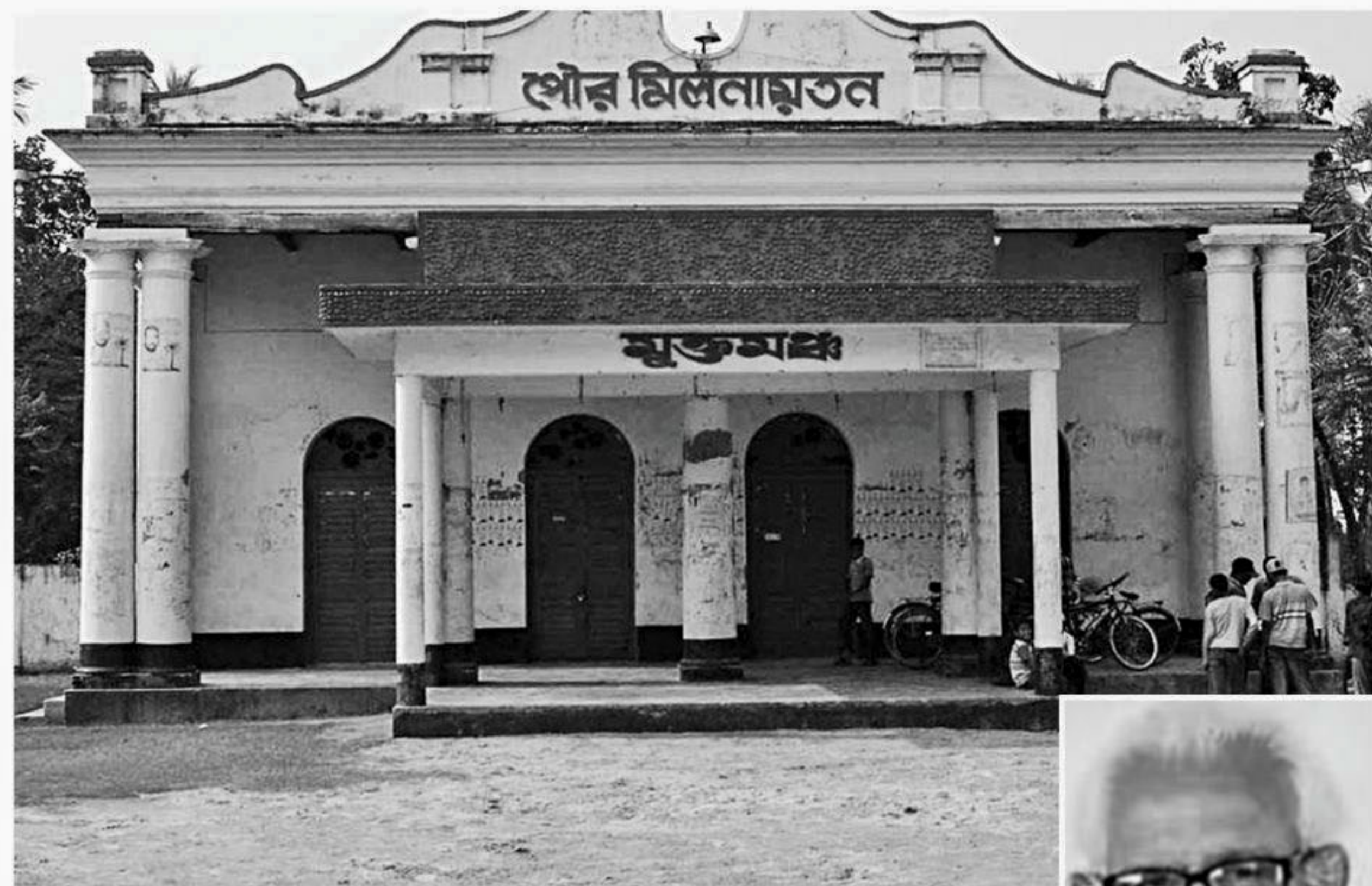
The old building of Pabna Town Hall where a meeting was held on February 27 in 1948 as preparation to launch a movement to press for the demand of giving Bangla the status as a state language of the then Pakistan. Inset, Ranesh Maitra, a leading veteran of the movement.

The role of those who took part in the early stages of language movement in 1948 should be recognised to keep the important part of the history alive among the new generation, Ranesh Maitra said.