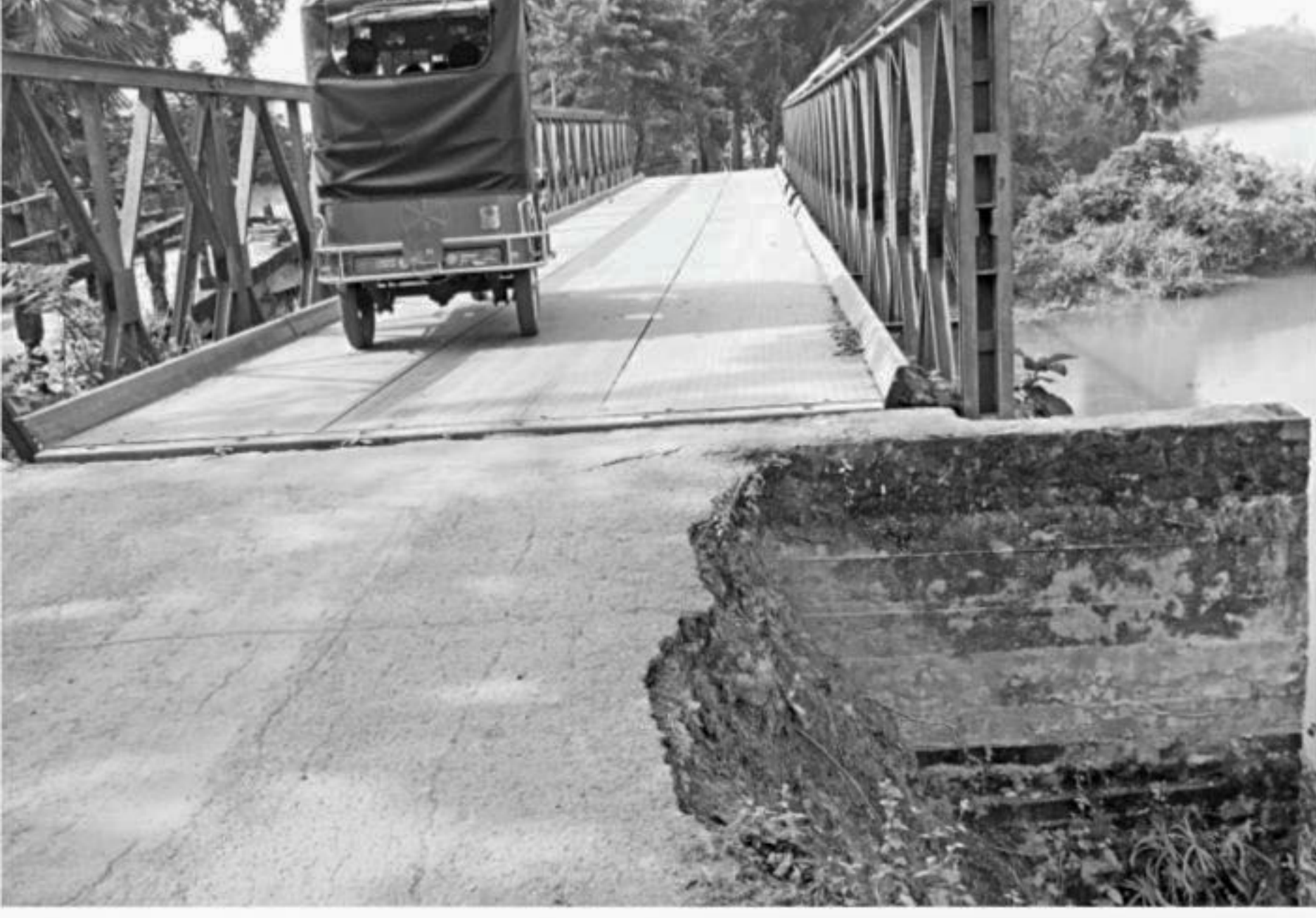
The recently taken pictures show the awful condition of Shekerhat-Guaton road in Jhalakathi Sadar upazila.