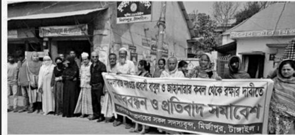
The people of Sawdagar community of Baimhati village in Mirzapur upazila under Tangail district form a human chain in front of Tangail Press Club yesterday demanding steps to save them from alleged false cases filed by a Norway expatriate couple. The cases were filed with an intention to occupy their lands, said the agitators.