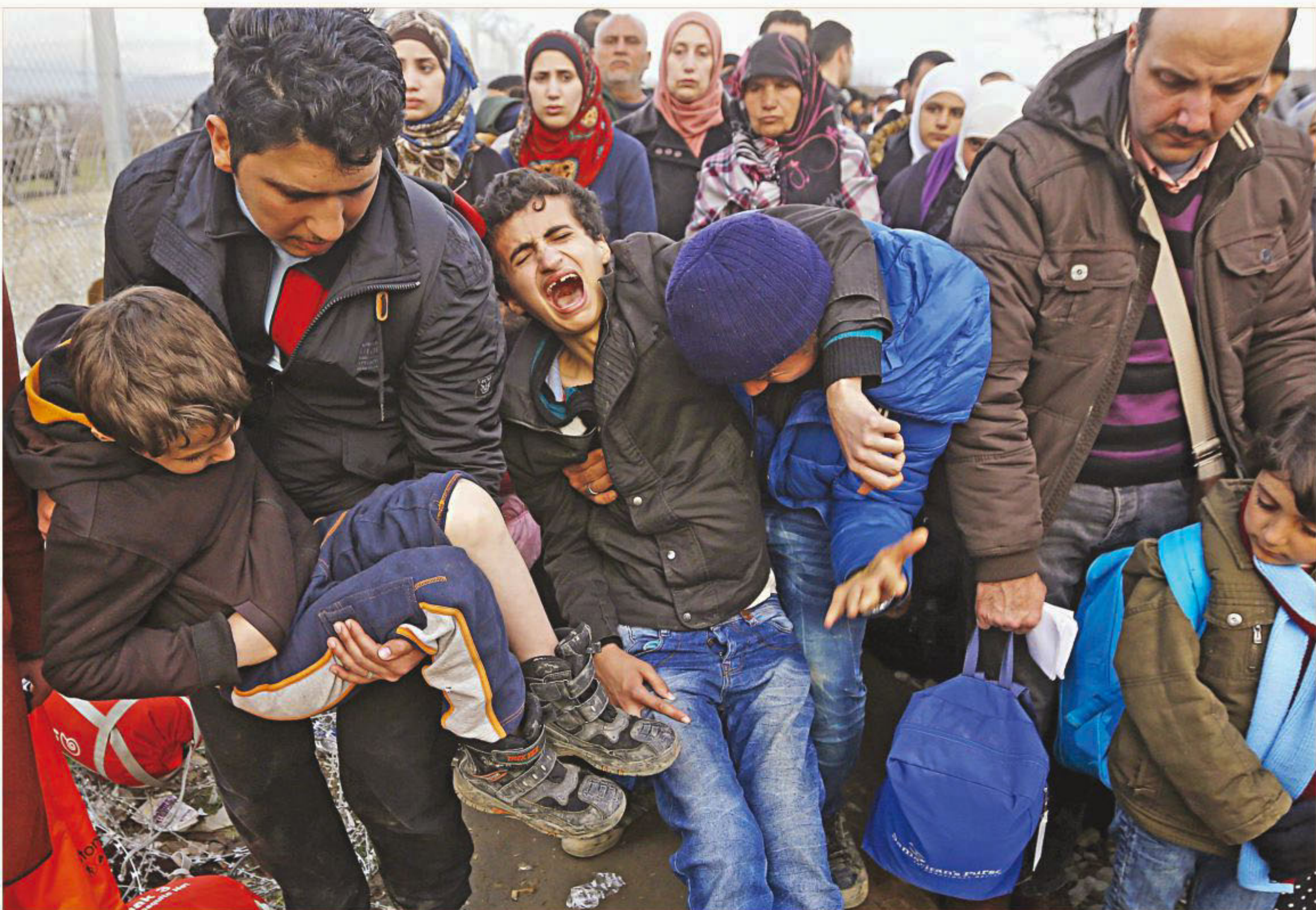
A young Syrian refugee screams in pain while he and hundreds of others line up at the Greek-Macedonian border on Saturday as the border crossing is reopened briefly near the Greek village of Idomeni.

BBC ONLINE A total of 36 people, including five rescue workers, are presumed dead following an explosion at a coal mine in northern Russia, officials said yesterday. Four miners were killed when a methane leak triggered two explosions in the mine near Vorkuta on Thursday. Rescuers were trying to rescue 26 trapped miners when a new blast occurred, killing five rescue workers and a miner. The rescue operation has been halted and those missing are presumed dead. The incident is one of the worst Russian mining disasters in recent times. "The circumstances in the affected part of the mine did not allow anyone to survive," Russia's Emergencies Minister Vladimir Puchkov said. "In the underground space where the 26 miners were, there are high temperatures and no oxygen", he added.