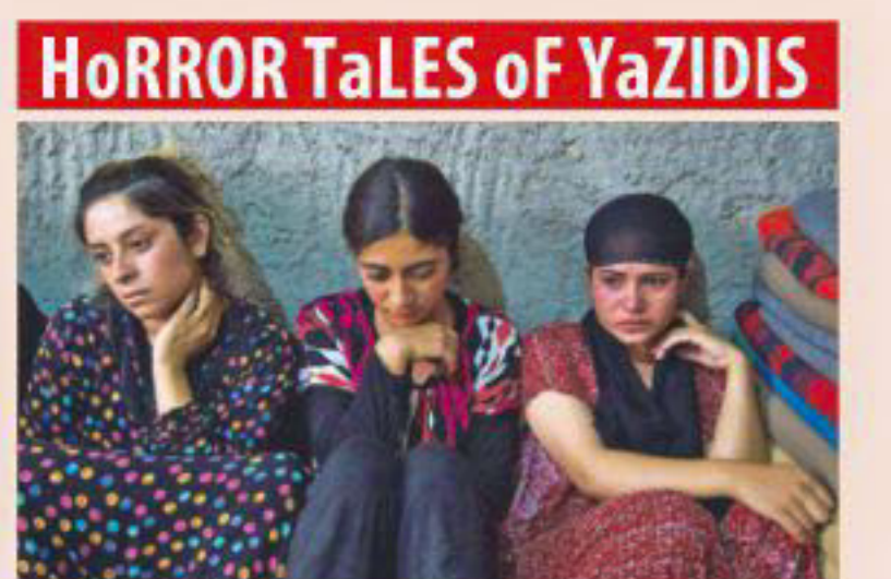
Horror Tales of Yazidis