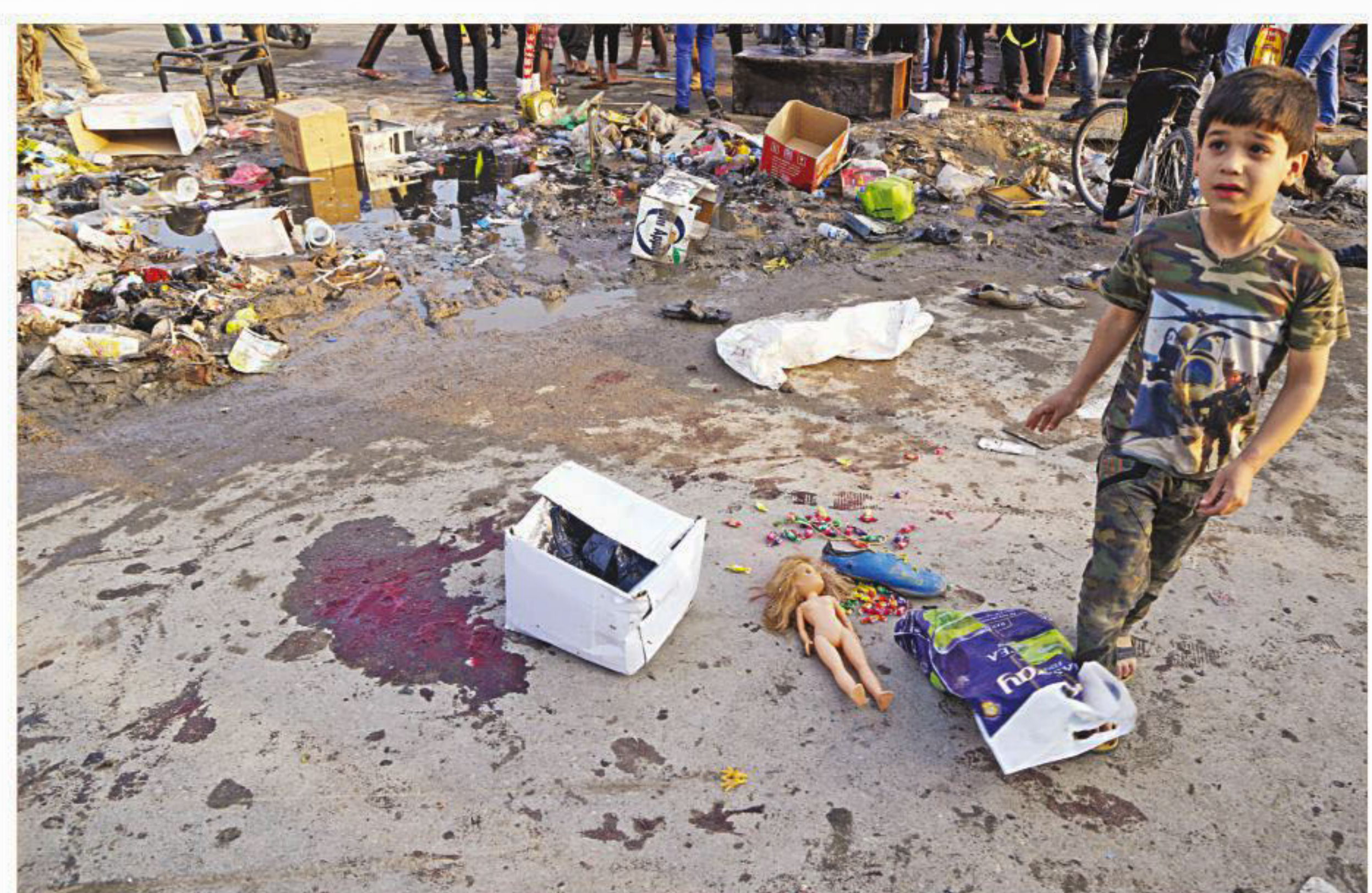
A boy walks at the site of suicide blasts in Baghdad's Sadr City yesterday.

AFP, Geneva Swiss voters yesterday rejected a proposal to automatically deport foreign criminals for even minor offences, according to referendum results showing a majority of cantons opposed. The poll came at a time when many European countries are hardening their attitudes to migrants after more than a million arrived on the continent's shores last year. Under Swiss law voters can change a law by popular ballot. To be passed it must be approved by a majority of cantons as well as a majority of electors. According to the latest results Sunday evening, the proposal was rejected by a majority of cantons, while the gfs.bern polling institute forecast that 59 percent of voters opposed it. The definitive voter result was expected later in the evening. In a referendum six years ago, more than half of Swiss voters backed strengthening rules to automatically expel foreign nationals convicted of violent or sexual crimes. The populist right-wing Swiss People's Party (SVP) -- which has accused parliament of dragging its feet on writing the text into law and watering it down when it did so last March -- proposed tougher rules which were put to the people in Sunday's referendum.