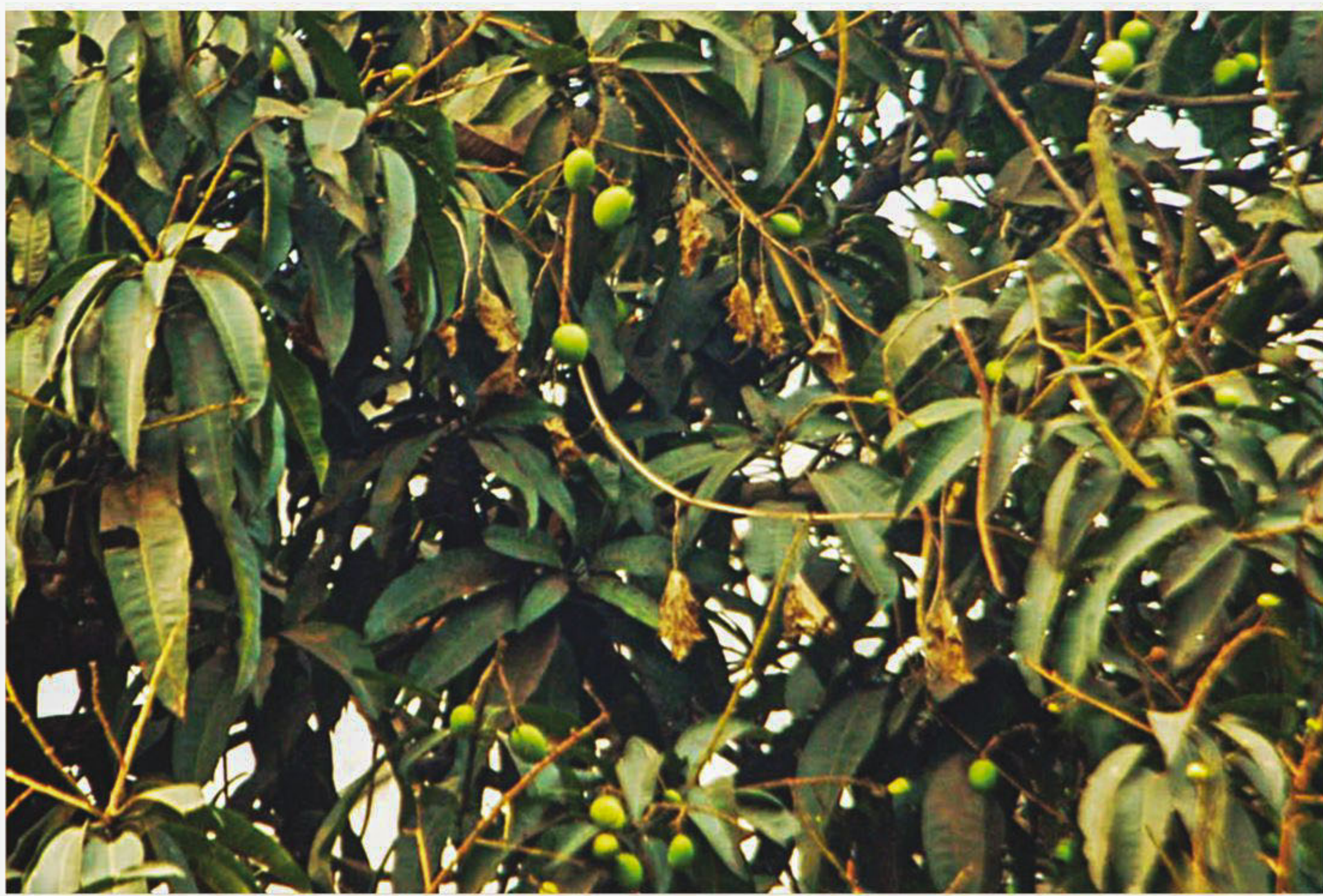
Mangoes are beginning to sprout as spring is already here. But the recent hailstorm damaged the fruits in some areas. The photo was taken at AGB Colony in the capital yesterday.

The minister said the teachers would have to undertake to comply with the code of conduct when