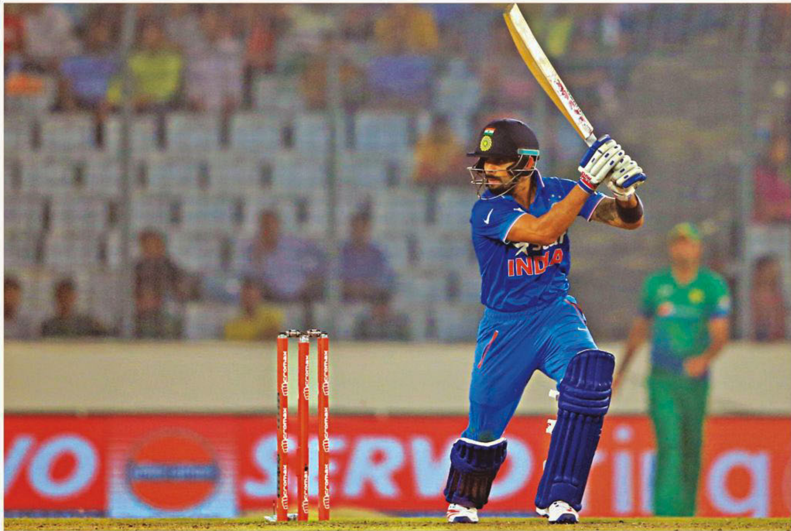
Virat Kohli lived through a thunderous spell from Pakistan speedster Mohammad Amir and scripted a masterful 49 to guide India to a five-wicket win over Pakistan in their Asia Cup T20 encounter at the Sher-e-Bangla National Stadium yesterday.