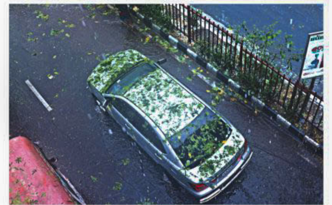
A layer of hailstones covers the road in front of the Jatiya Press Club in the capital, moments after the surprise hailstorm stopped yesterday. Drivers had to turn on the headlights, top right , to maintain visibility as a night-like darkness enveloped the capital in the middle of the day with pitch-black clouds hiding the sun completely. People frolicking with hailstones, middle right , following the storm that soothed them after a hot and humid spell. A car speckled with dry leaves, bottom right , moves along the road after the storm.