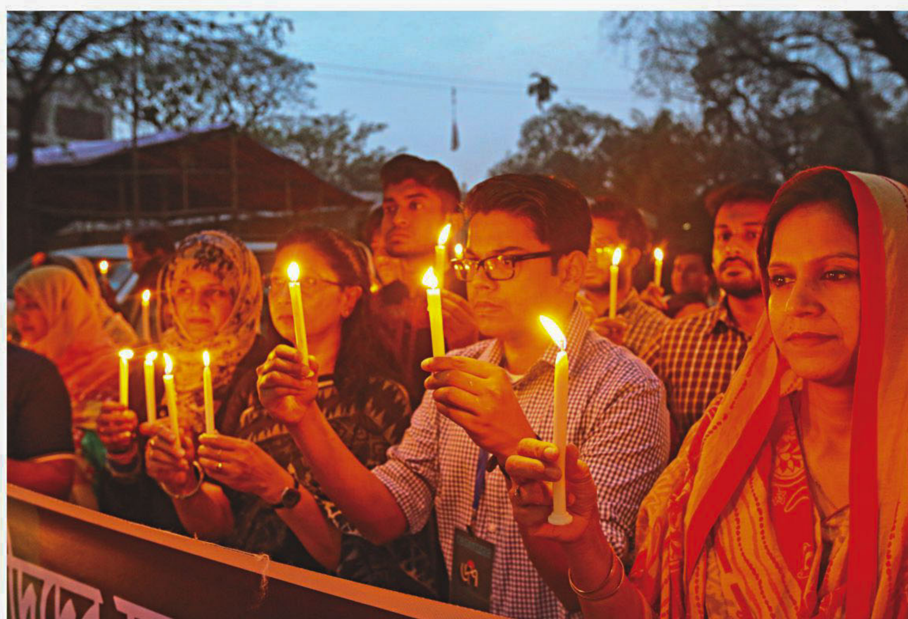
Families and friends mourn the army officials, who were slain in the BDR carnage on February 25-26 in 2009, at a candlelight vigil at the Jatiya Press Club yesterday to mark the anniversary of the massacre.