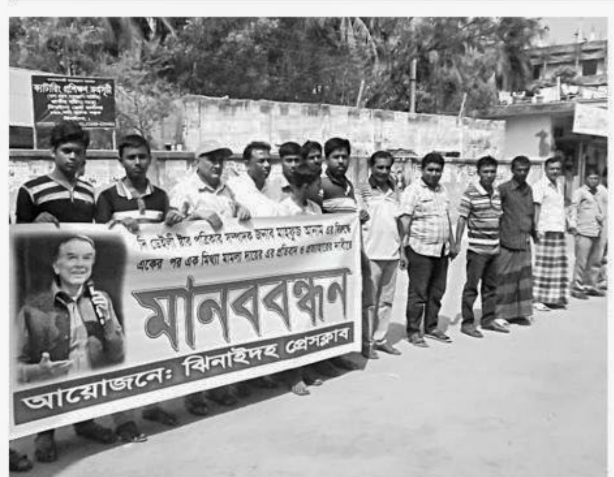
Jhenidah Press Club forms a human chain in front of Jhenidah Press Club, left, and The Daily Star Readers' Forum organises a similar programme on Station Road in Bogra town yesterday, protesting recent filing of a barrage of cases against The Daily Star Editor and Publisher Mahfuz Anam across the country.

Fishermen, trawler owners and workers form a human chain in Pathorghata upazila town in Barguna district yesterday demanding effective actions to stop random attack, abduction and murder of fishermen by robbers in the Bay.