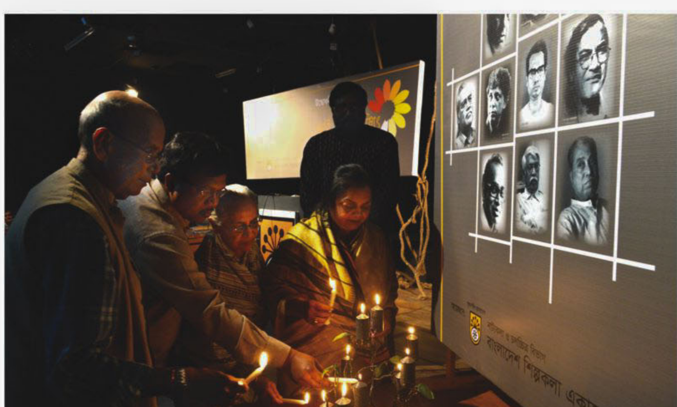
(From left): Syed Shamsul Haq, Liaquat Ali Lucky, Sara Ara Mahmood and Professor Nasreen Ahmed at the inaugural ceremony.