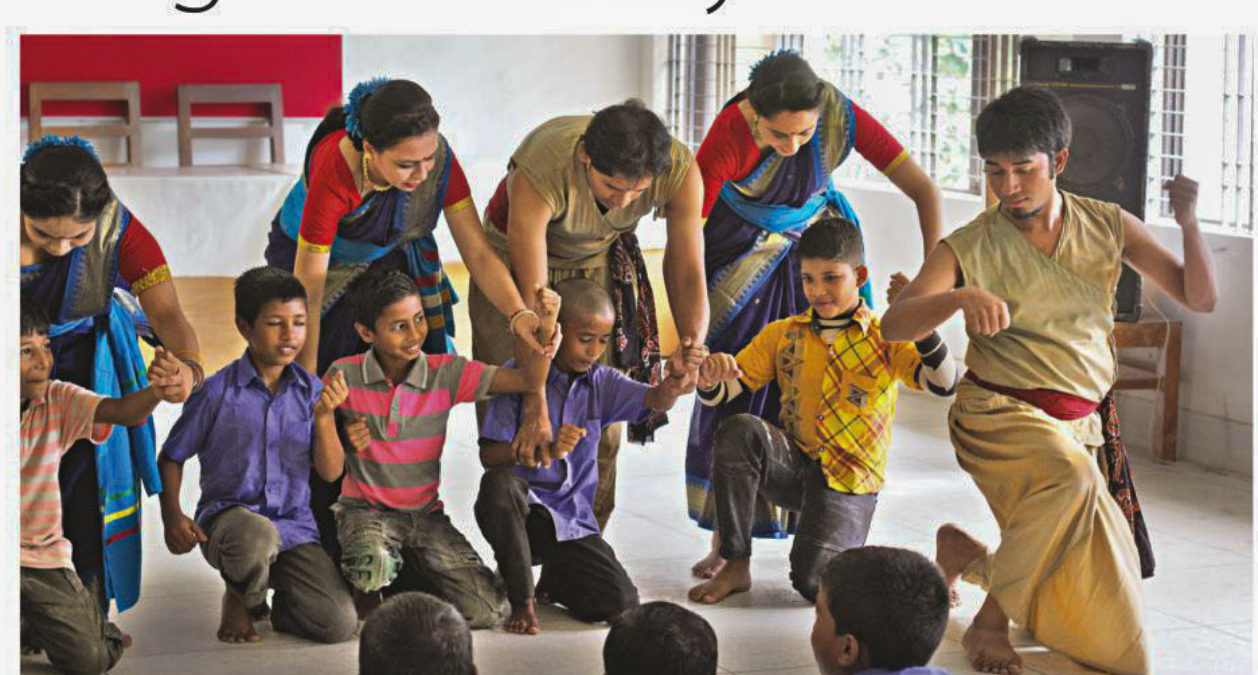
Nritya Nandan took this project to special schools for underprivileged children as well as orphanages.