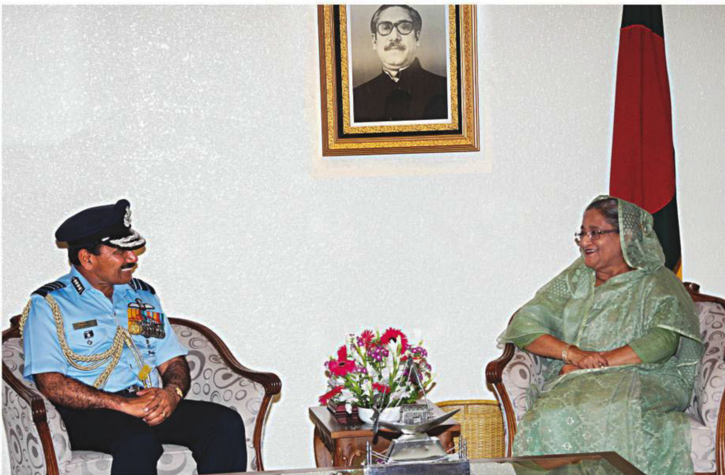
Visiting Indian Air Chief Marshall Arup Raha meets Prime Minister Sheikh Hasina at her office in the capital yesterday.

A total of 93 new books hit the fair yesterday.