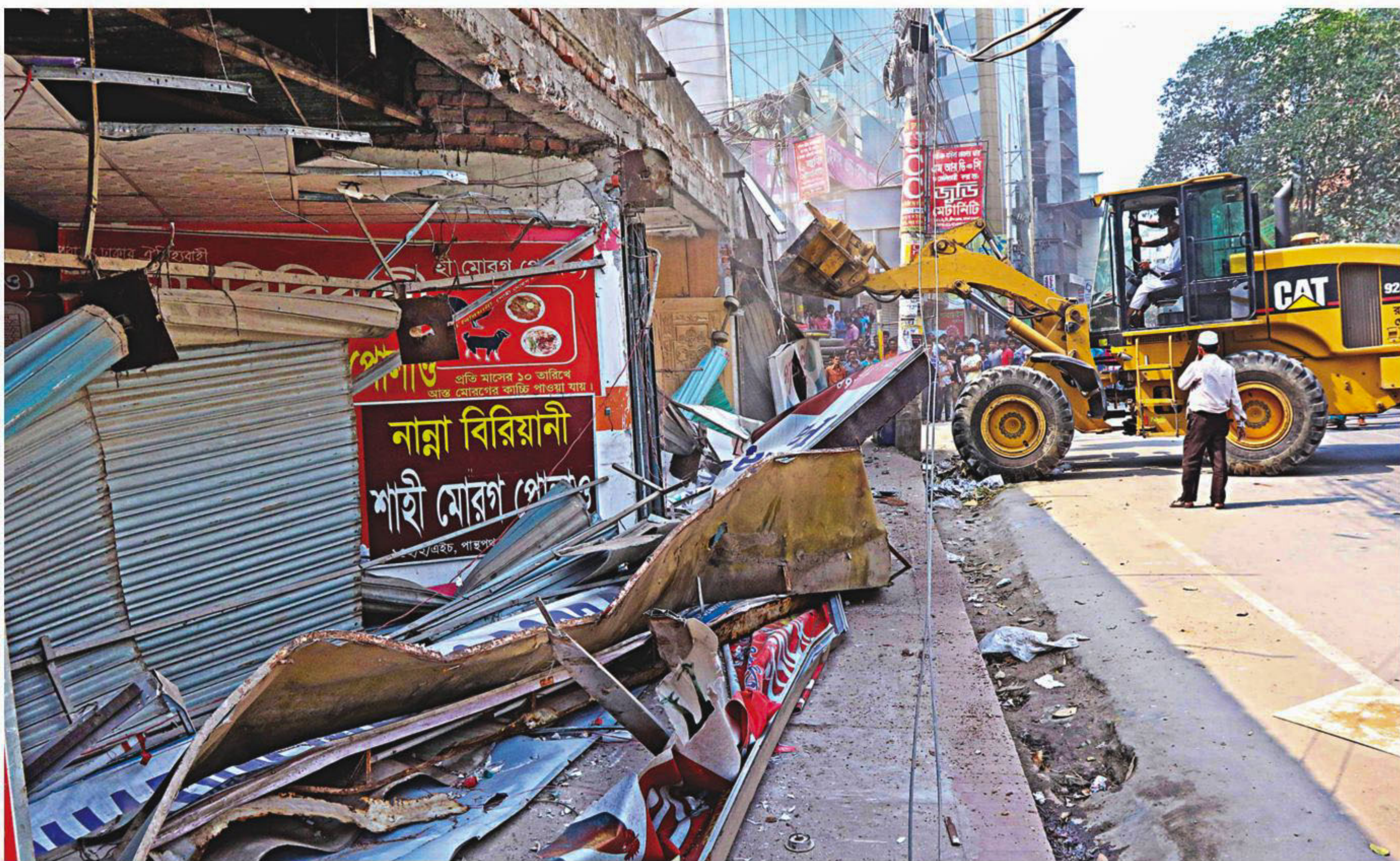
Rajuk knocks down an illegal structure in front of the capital's Russell Square in Panthapath area as part of a simultaneous drive in Dhanmondi, Gulshan and Uttara yesterday to recover designated car parking spaces and remove illegal access ramps built occupying footpaths and road width.