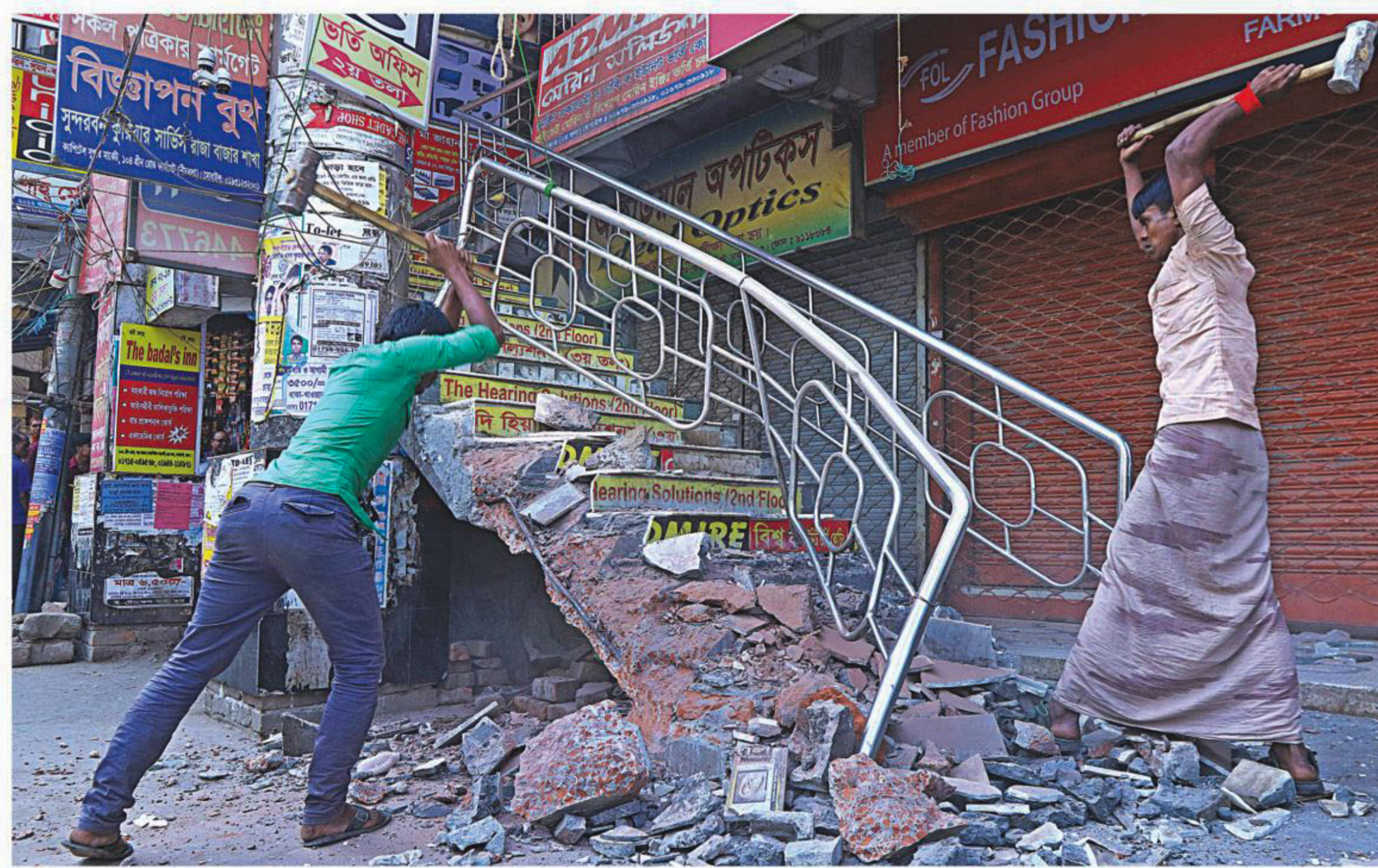
Workers of a Rajuk mobile court yesterday demolish stairs of a market at the city's Farmgate. The owner of the market allegedly built the stairs without Rajuk approval.