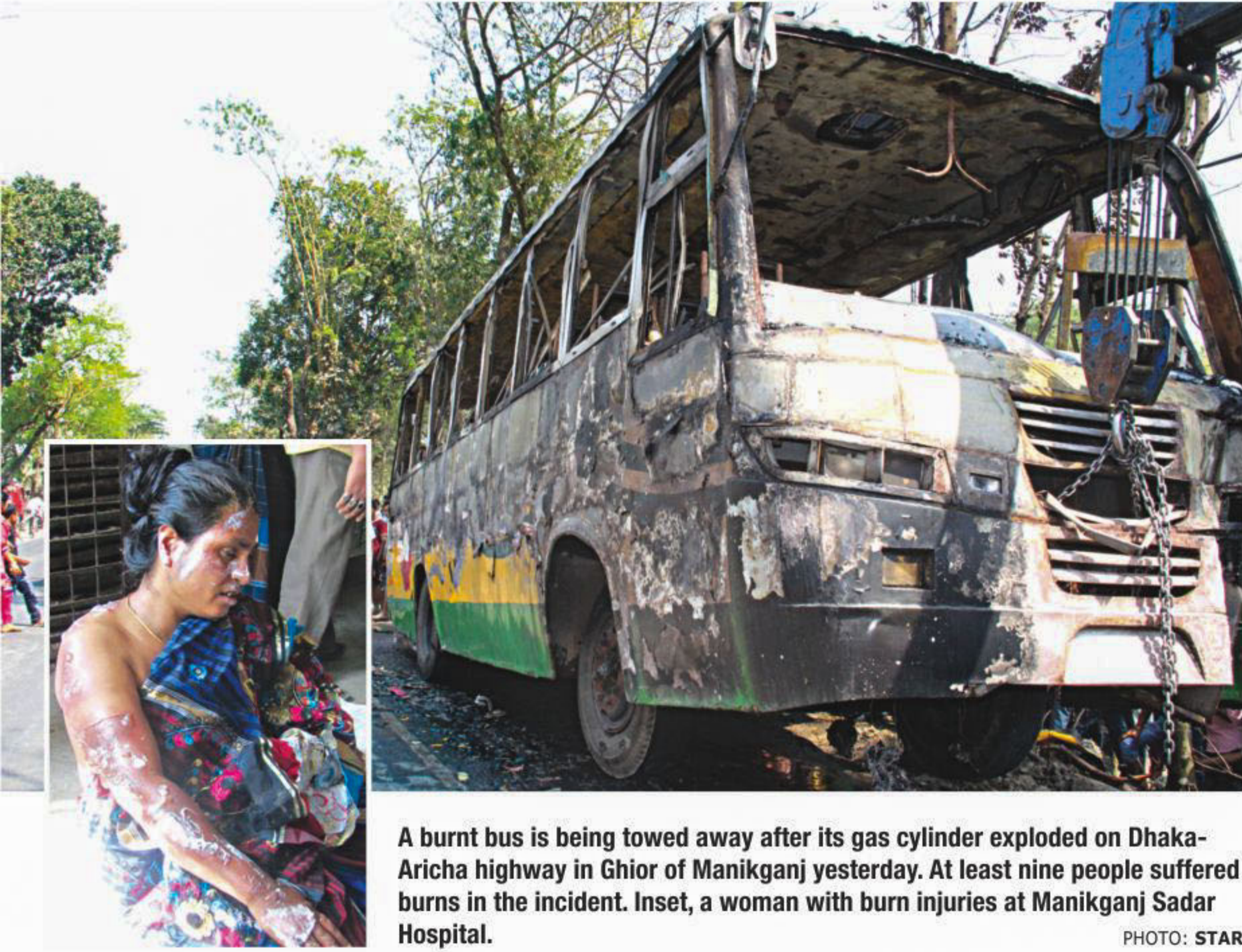
A burnt bus is being towed away after its gas cylinder exploded on Dhaka-Aricha highway in Ghior of Manikganj yesterday. At least nine people suffered burns in the incident. Inset, a woman with burn injuries at Manikganj Sadar Hospital.