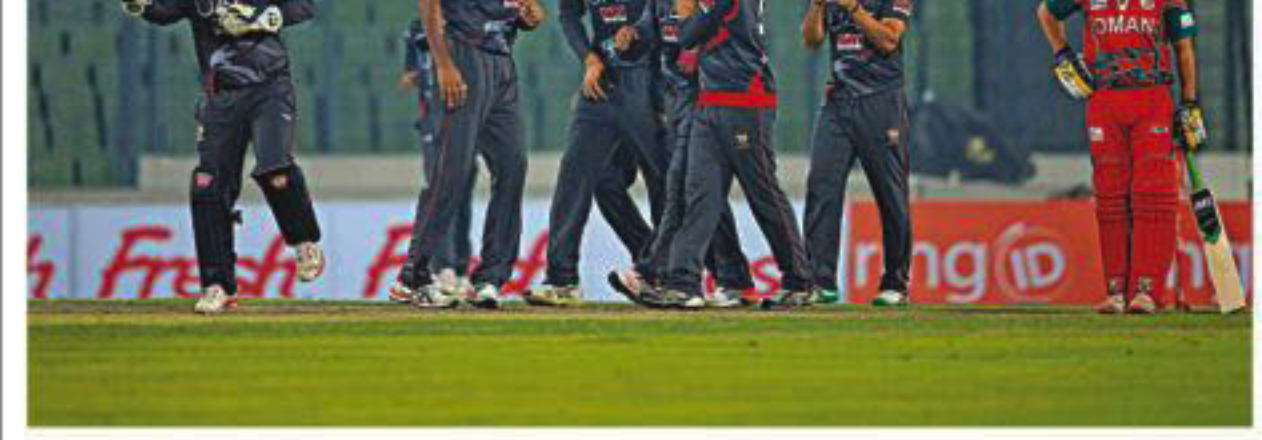
The UAE players celebrate their 71-run victory over Oman, which ensured their qualification for the Asia Cup tournament proper in Mirpur yesterday.