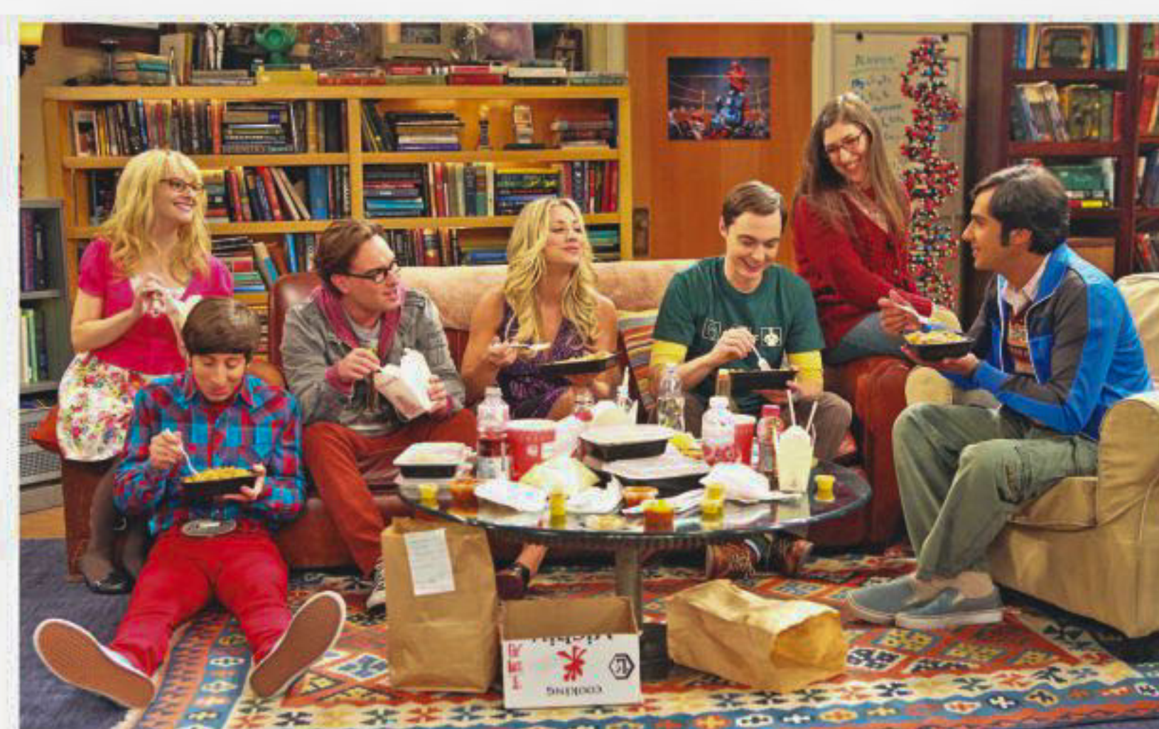
The sitcom about lovable nerds and their awkward social interactions has won popularity and acclaim.

"I remember spending a lot of time memorising because it was probably the wordiest audition I've ever gone in on. Any humour was not going to be funny if I was